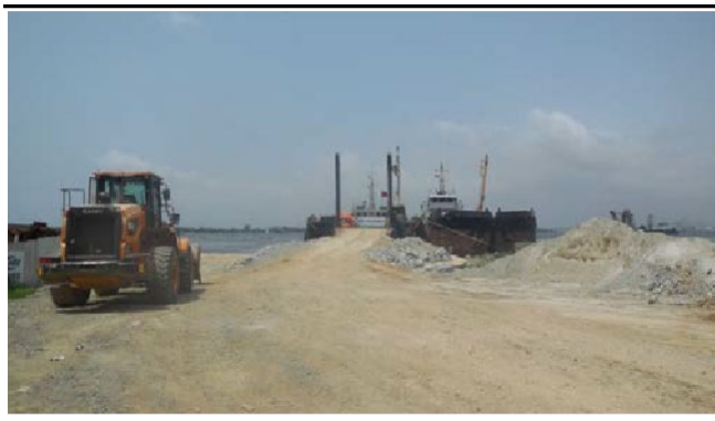
Figure 0.2 Existing CHEC unloading dock near the Project site

A loading dock located northwest of Vridi channel on the island Bakré, previously developed by China Harbor Engineering Company (CHEC) will be used for unloading of materials and equipment. Extension work and redevelopment of the dock will be needed.