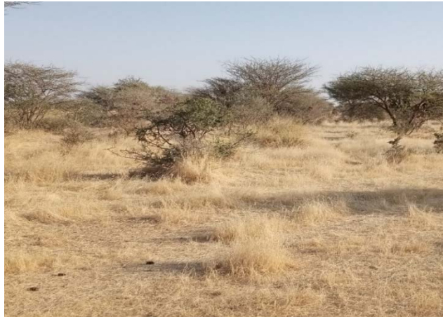
Photo 3: Tree steppe with a herbaceous carpet dominated by Phragmites australis

Photos 3, 4 and 5 illustrate some of the associations observed in terms of clustering in the permit area.