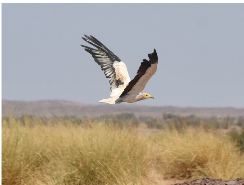
Photo 9 Egyptian woodpecker

Of these birds, only the Oricou Vulture and the Egyptian Vulture are classified as endangered on the IUCN Red List (see Table 7 below), in CITES Appendix II and CMS Appendix II/I for the Egyptian Vulture and CMS Appendix I for the Oricou Vulture.