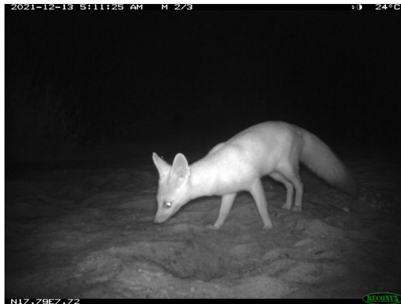
Photo 6 Fennec photographed by the camera

Of these mammals, only the Dorcas Gazelle and the mouflon are classified as vulnerable on the IUCN red list.