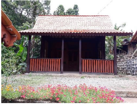
Replication of Osing traditional house in Kemiren