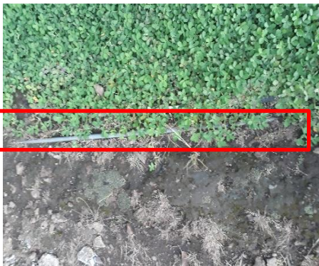
Water pipe, distributing clean water from springs in Kalibendo Plantation to Grogol Village

KII with Secretary of Grogol Village (Pak Isnaeni)