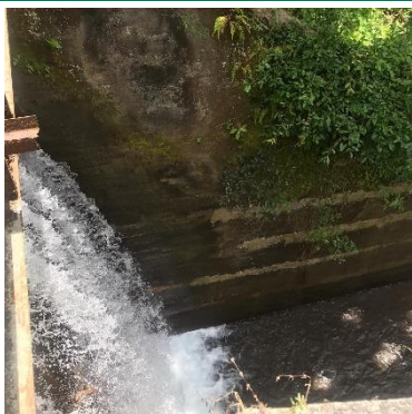
Kalongan waterfall in Pesucen Village used as clean water source