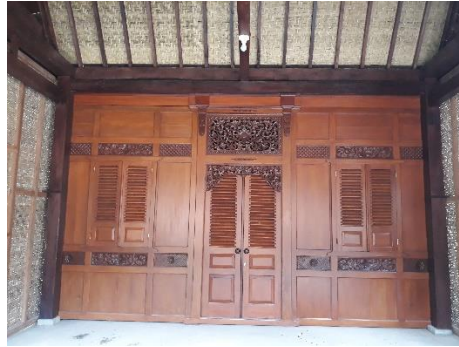
Detail of Osing traditional house in Kemiren