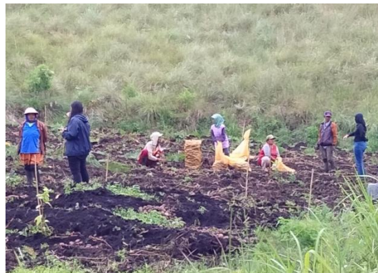
Discussion with local farmers who resume agricultural activity near IJN05