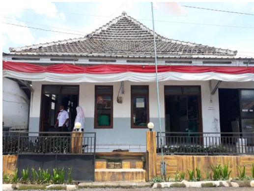
Office of Kalianyar Village