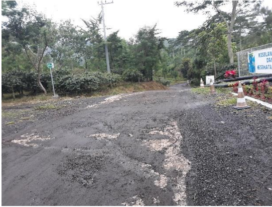
Main Access Road to Project Area (village road toward Curah Macan Sub-village)