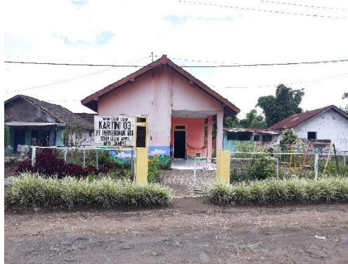
Social infrastructure in Jampit Village