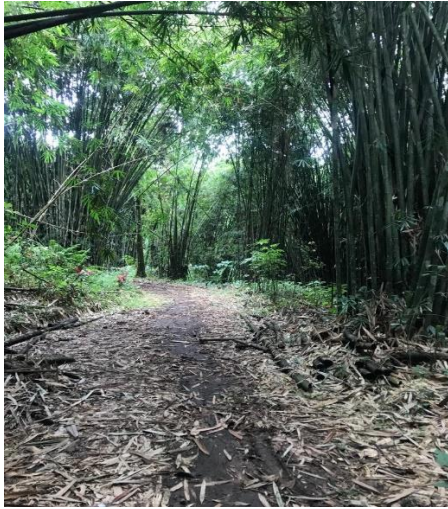
Site walkover in Kalibendo Plantation