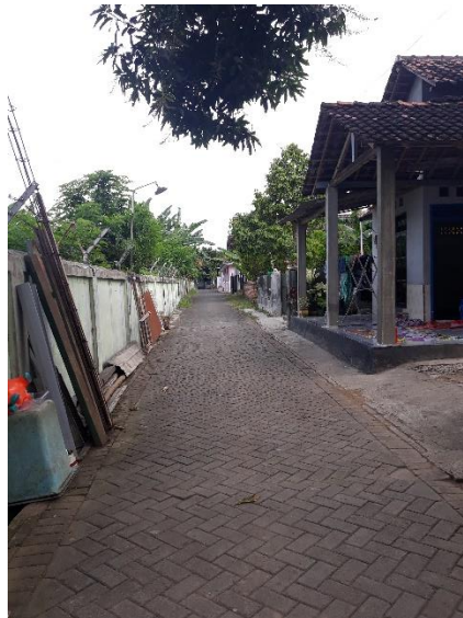
Access road to the proposed transmission line facility