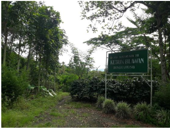
Proposed site for tower development in PTPN Blawan (Kalianyar)