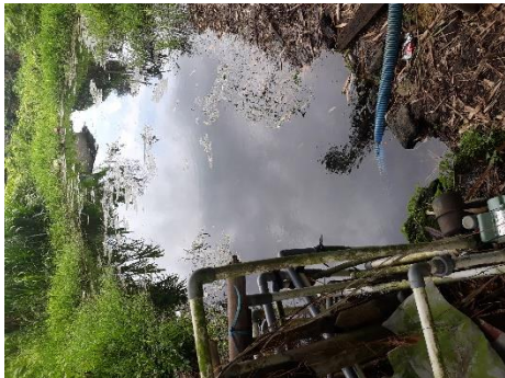
Spring used as one of clean water sources in Sempol Village, apart from water well