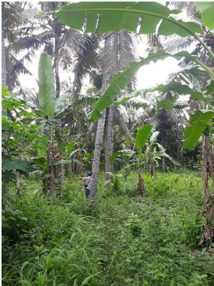
Estimated area for transmission line in Giri