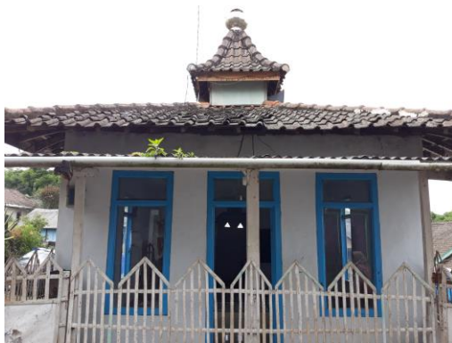
Social infrastructure in Curah Macan (2)