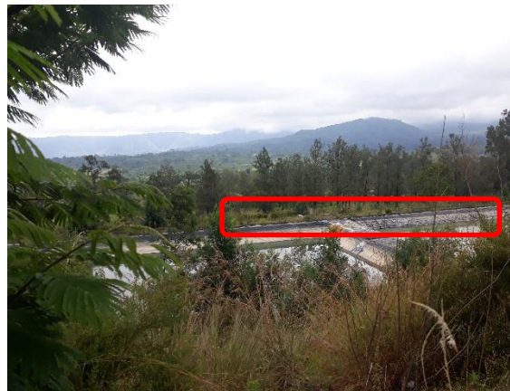
Fence surrounding retarding basin area near IJN06 which has been trespassed by cow of local farmer