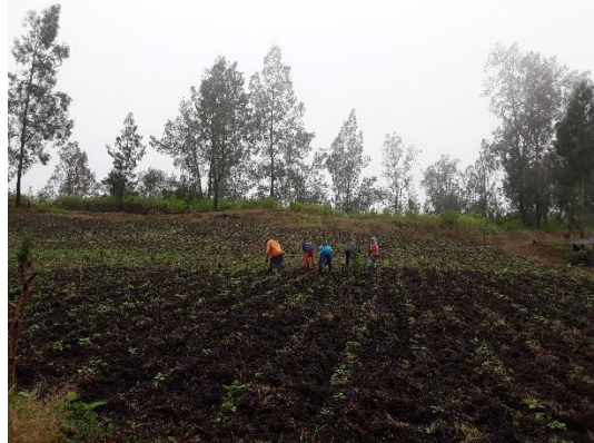
Agricultural activity within the Project Area