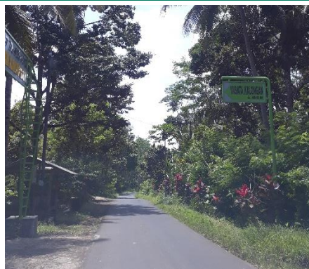
Tourism spot in Pesucen Village