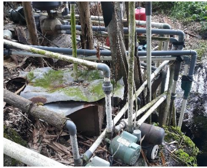
Water pumps built by villagers in Sempol Village to distribute clean water