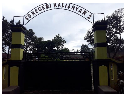
Social infrastructure within the Project Aol (2)