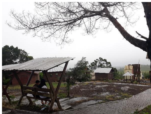
Tourism facility (part of Wurung Crater) near the drilling point of IJN 06 (650 m)