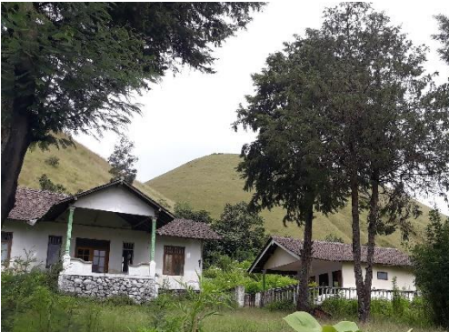
Burial site of local community figure (Mbah Parto)