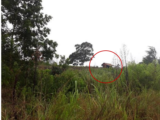
Farmer's hut near the drilling point of IJN 05 (<150 m)