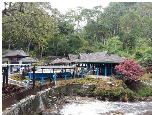
Tourism spot (Blawan hot spring) near Project's associated infrastructure/ water intake (500 m)