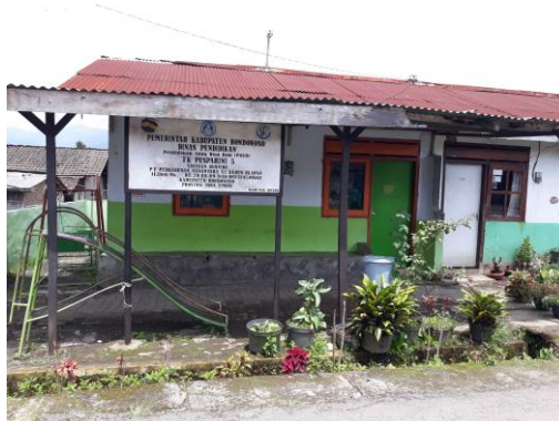
Social infrastructure in Curah Macan (the nearest settlement to Project area)