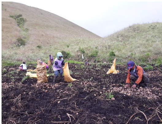
Family farmers from nearby village (Jampit Village) harvesting potatoes approximately 1 km from IJN05