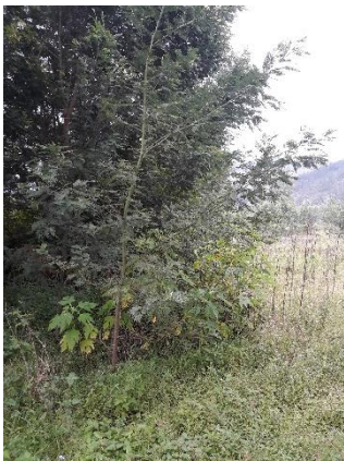
Estimated area for the transmission line/ T01 (near Wurung Crater)