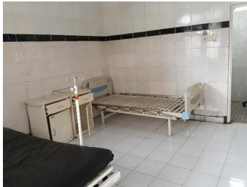
Inpatient facility in Puskesmas Sempol (health facility near the Project area)

Key informant interview with community leader in Curah Macan Sub-village