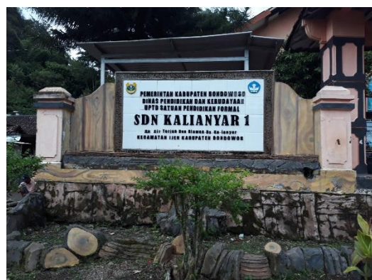
Social infrastructure within the Project Aol (1)