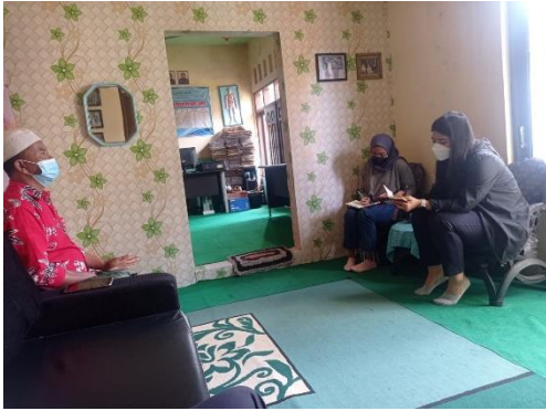
KII with informal leader of Jampit Village