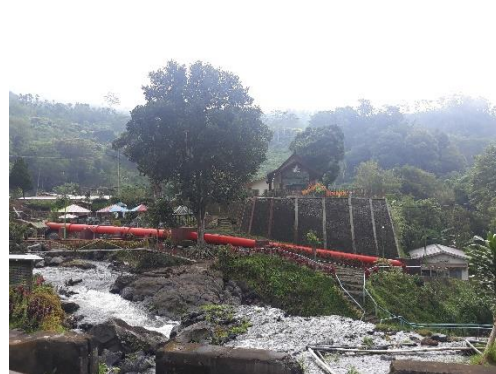
Torusim spot near the Project Area (Mini Niagara Fall)