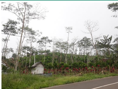
Estimated area for transmission line (Tamansari)