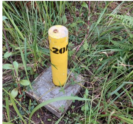
Sign of proposed site for tower development (near Paltuding)