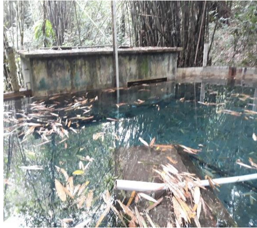
Springs "Patemon" in Kalibendo Plantation which used by surrounding villages (Tamansari, Bulusari & Kampung Anyar)