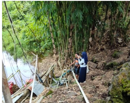
Sitewa king in Sempol Village