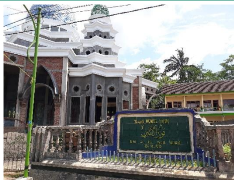
Social infrastructure in Bulusari Village