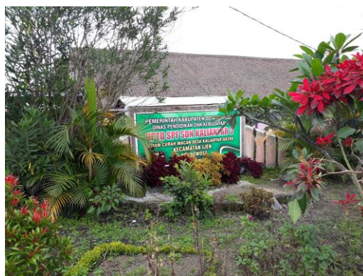
Social infrastructure in Curah Macan (3)