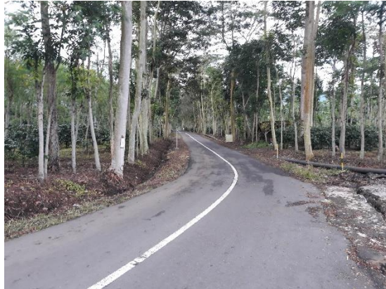
Main Access Road to Project Area (Jl Kawah Ijen)