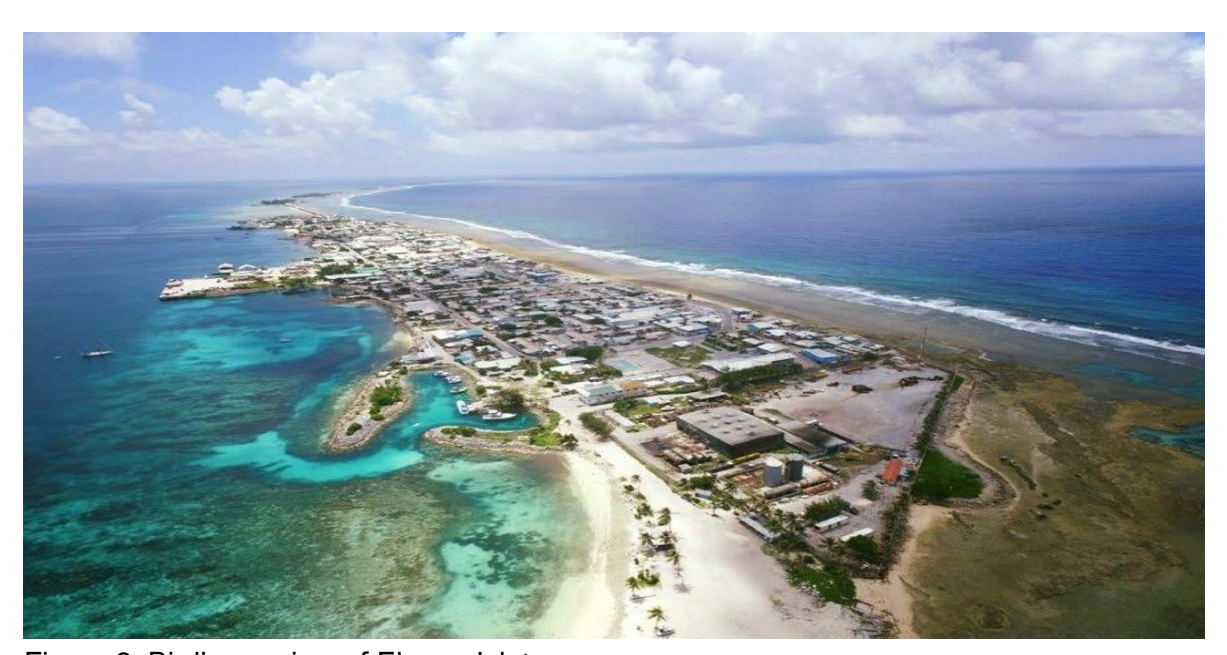
Figure 2: Bird's eyeview of Ebeye Islet,