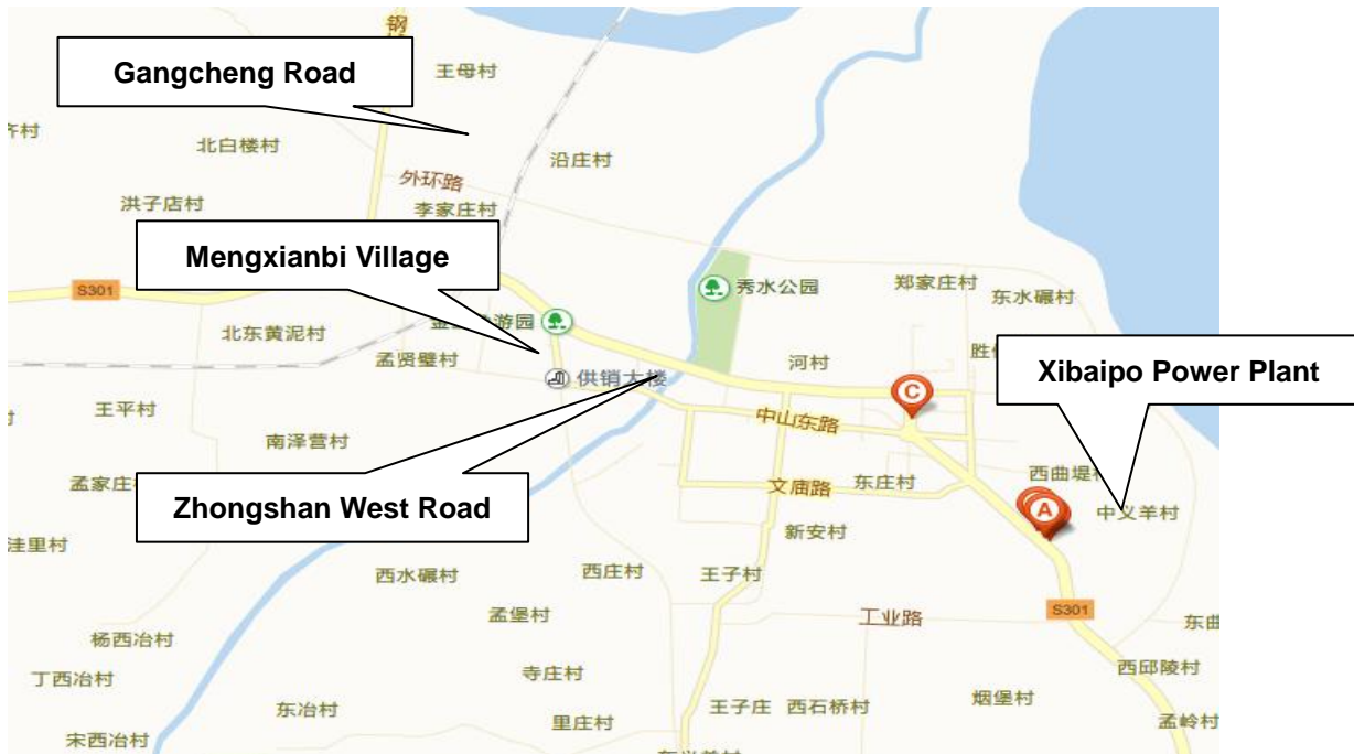
Figure 1 Locations of Zhongshan West Road, Gangcheng Road, Mengxianbi Village and Xibaipo Power Plant