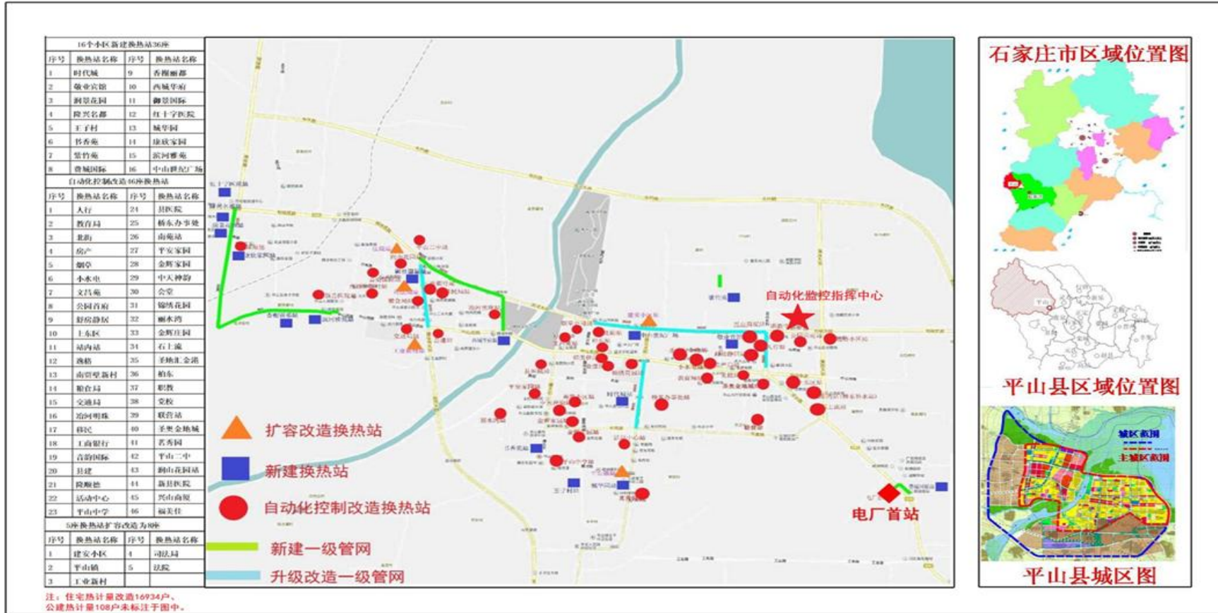
Figure 2 Location map of heating pipelines and heat exchange stations