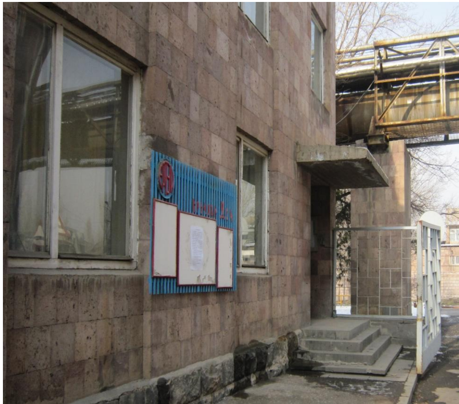
Photo: Notifications placed at YTPC

Over the public consultation period no concerns, questions, or comments have been received on the EMP from any individual or a legal entity. Therefore, this document is considered final in its present iteration.