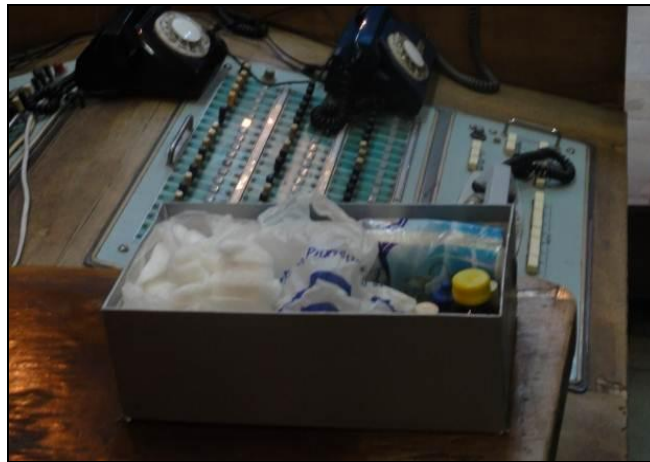
Photo 4-1: Poorly equipped first aid kit, as available at the control room of YTPC s/s

At all substations medical first aid kits are available. According to the staff, these kits are inspected and renewed regularly. However, the kits were found to be in a very poor condition (see Photo 4-1). A defibrillator was not available at the substation.