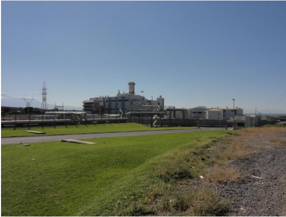
Photo 10-1: Overview about new combined cycle power plant at Yerevan