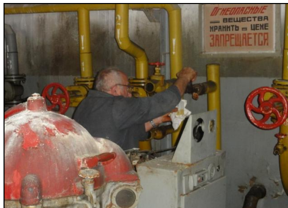
Photo 4-3: Taking of oil samples from oil storage site at s/s YTPC

In all analyzed oil samples the concentrations of PCB were below 20 ppm. 50 ppm is the threshold of PCB content; above this value specific measures would be triggered. Following Stockholm and Bern Conventions, relevant EU Directives (e.g. 75/439/EEC) and U.S. EPA recommendations oil with a PCB concentration of less than 50 ppm is not considered to be PCB-containing oil and can be reused or recycled without any further treatment 1 .