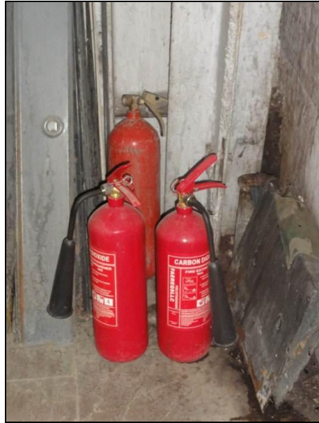
Photo 4-2: Fire extinguisher (powder) inside control building at YTPC s/s

Basic personal safety equipment, as helmets, gloves, tools for working under high voltage are available at the substation and are used by the substation staff. Metal clad clothes to protect workers from electric fields when working under high voltage are not available.