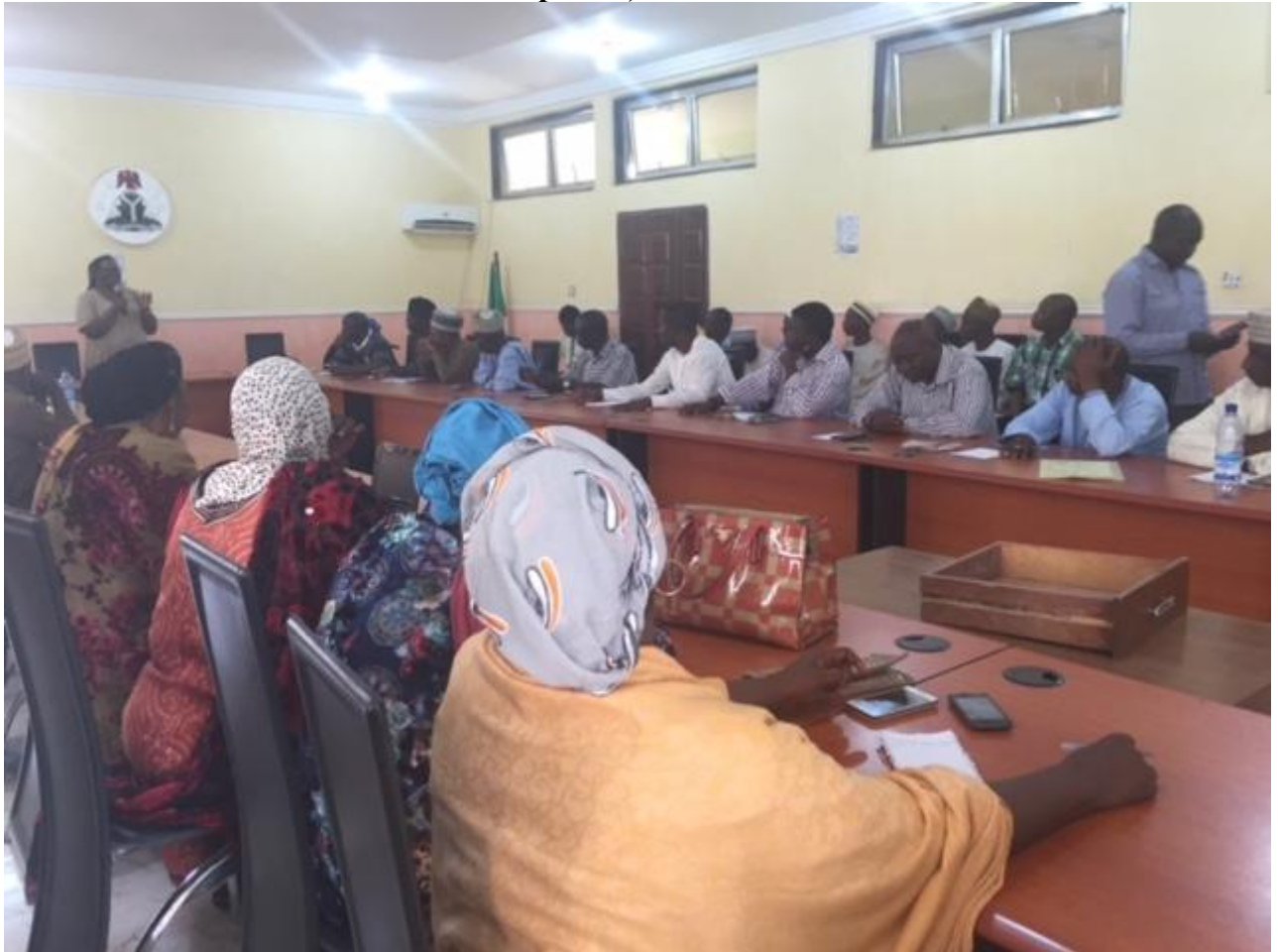
Photo of Consultations with CSOs on April 13, 2017