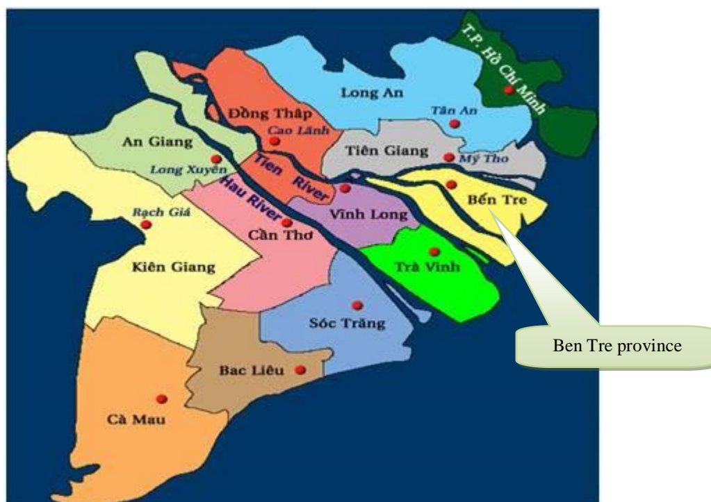
Figure 2: Location of Ben Tre city in relation with Ho Chi Minh city and Mekong Delta region

On August, 11 th 2009, Ben Tre City was officially raised to the status of a Level 2 City. It has 17 administrative units of wards/communes, in which there are 10 inner wards (ward 1, 2, 3, 4, 5, 6, 7, 8 Phu Khuong and Phu Tan) and 7 suburban communes (Binh Phu, Son Dong, Phu Hung, My Thanh an, Phu Nhuan and Nhon Thanh) Hiep Thanh, Vinh Trach, Vinh Trach Dong). The total natural area is 71.11 km 2 .