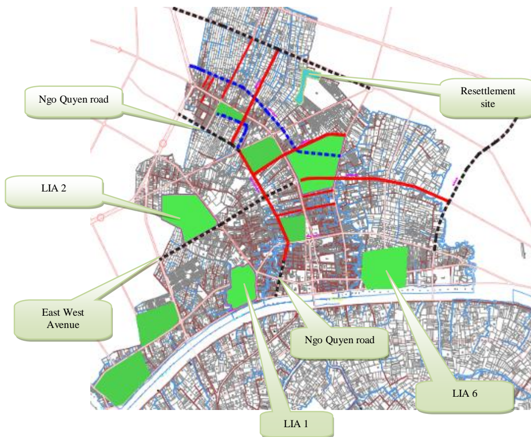
Figure 1: The overview map of proposed investments under Components 1 and 2.