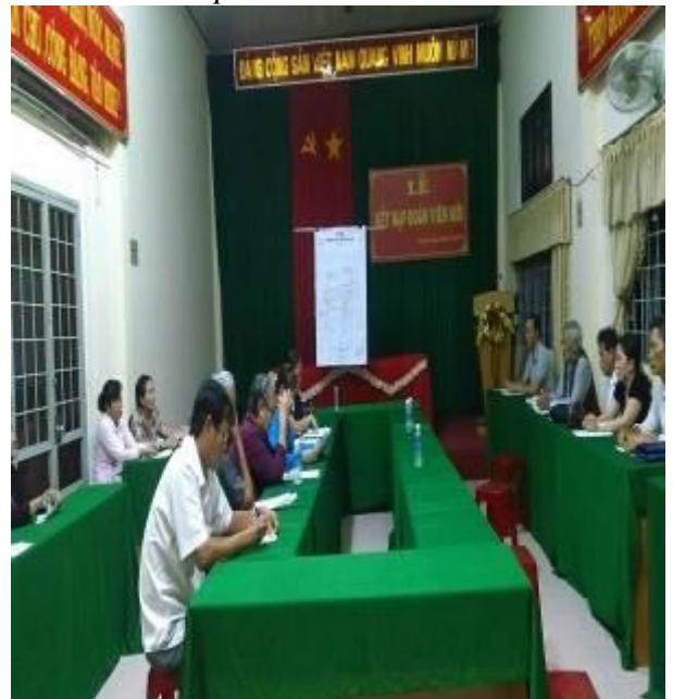
Ward 4 – Component 2