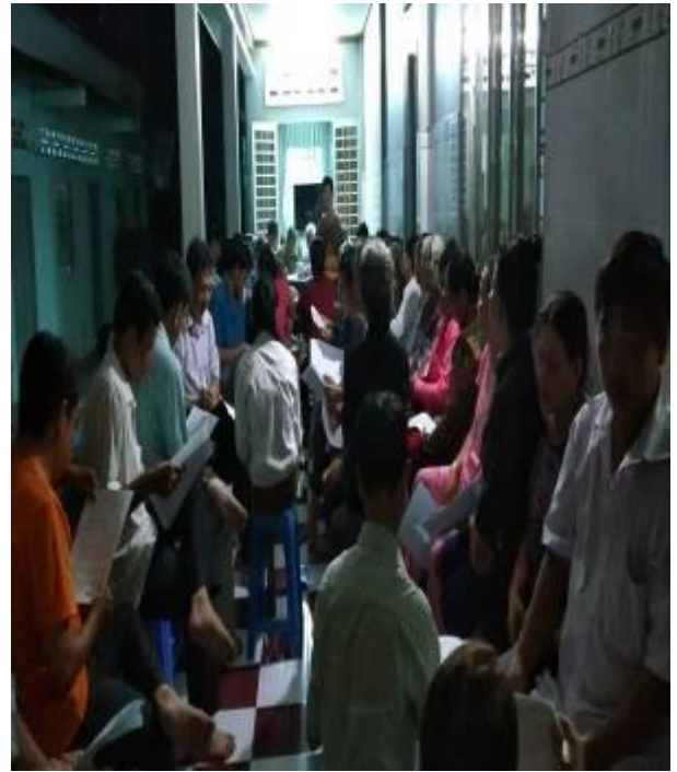
Ward 5 – Component 1