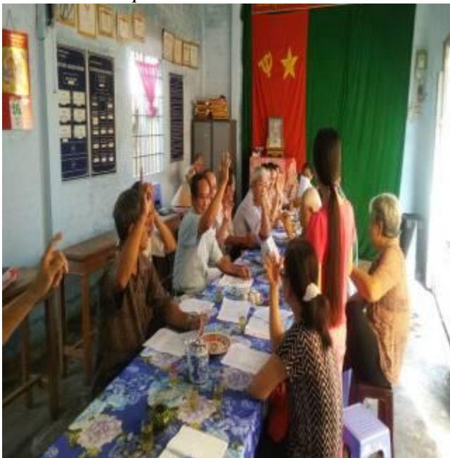
Phu Tan ward – Component 2