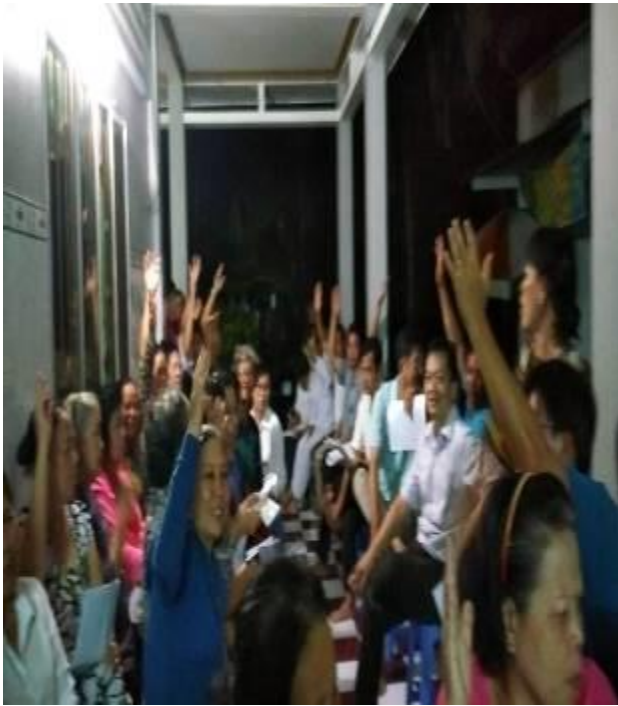
Ward 5 – Component 1