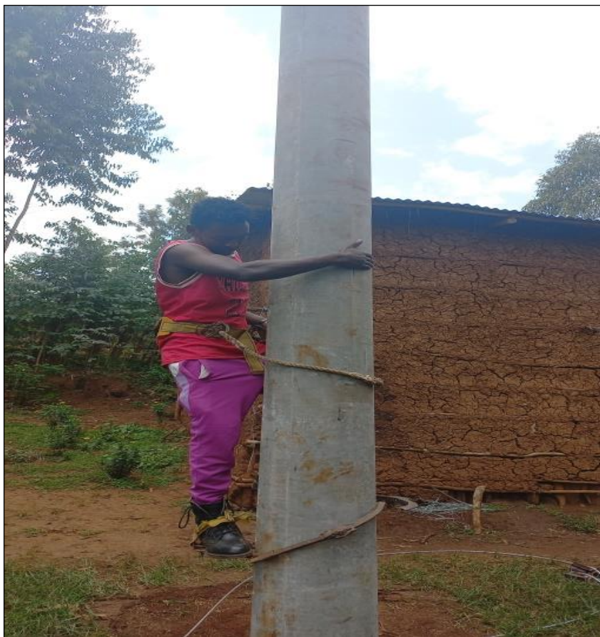
Picture 3 – Worker using Climbing Shoe for Work-at-Height, SNNP Region