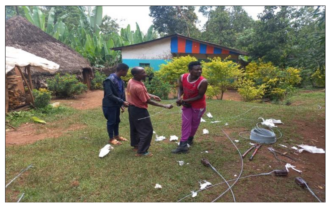
Picture 4 – Conductor Preparation Work in Progress, SNNP Region (No PPE Used)