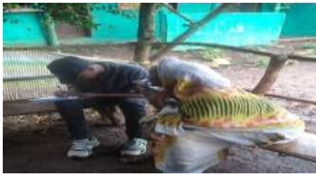
Jibat Key Informants-1