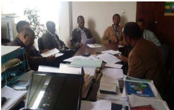
Oromia BoA Expert Consultation