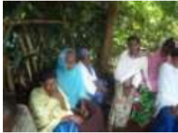
Gera Woreda Men and Women FGD Participants- PIC-3