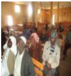
Gera Woreda Men and Women FGD Participants- PIC-1