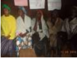
Yayu Community Consultation-2