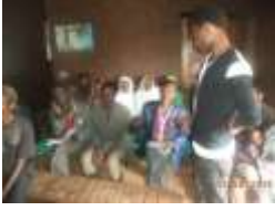
Yayu Community Consultation-1