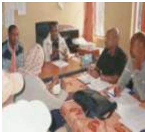
Dodola Woreda Consultation Participants-2