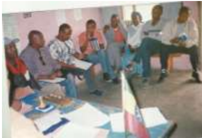
Dodola Woreda Consultation Participants