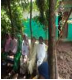
Gera Woreda Men and Women FGD Participants- PIC-2