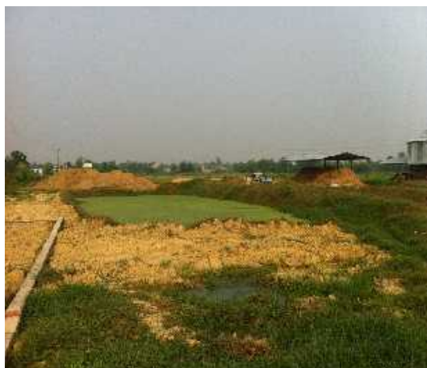
Picture 2-3: Waste disposal pond at Lumbini Agro Products and Research Centre

Lumbini Agro Products and Research Centre, Rupandehi was established about 5 years ago in 2008 in Tikuligadh VDC, Rupandehi. Currently, the farm is spread over 32 Bigha (216,717 m 2 ). During the discussion with the farm official, the farm currently has a total population of 269 cows, and about 3,374 Kg of dung and 2,638 litre of urine are produced daily. All of the wastes from the farm are disposed into open ponds built within the premise of the farm.