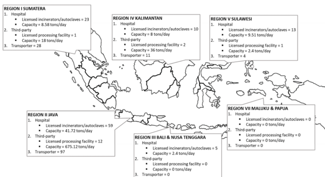
Figure 4-2 Distribution of medical waste processing facilities and transporters 8