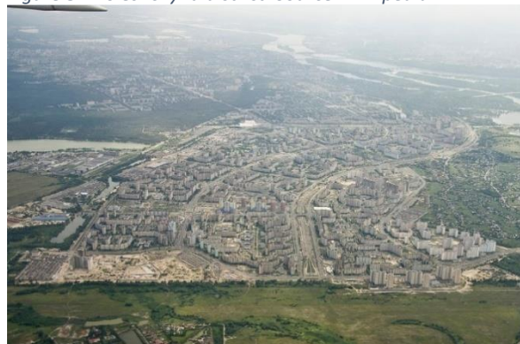
Figure 3: Troieshchyna district.

Troieshchyna district, located at the north left bank of Kyiv, with a population of about 300,000 inhabitants, is underserved by public transport. Residents of Troieshchyna have no access to mass rapid transit at present – despite legacy promises from the 1980s to develop an additional metro line. Their linkages to Kyiv’s city center and metro network are currently limited to low quality options including infrequent and poorly connected tramway / city train services, trolley bus, and marshrutkas lines that operate in mixed use right of way. All these services provide poor travel conditions, low level of accessibility and no fare integration. There is currently a technical and economic study of options underway using a World Bank Group (IFC+IBRD) supported grants for a new mass rapid