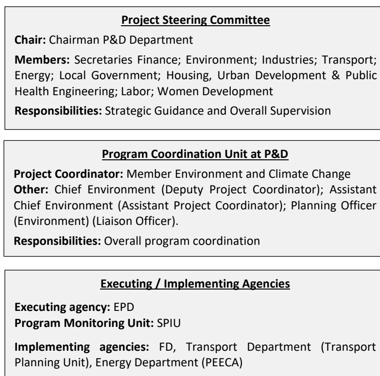
Figure 2. Institutional Arrangements for Program Implementation

49. Through multiple rounds of stakeholder consultations, GoPunjab has decided to adopt the institutional arrangements shown in Figure 2. At the Program level, it will establish a Program Steering Committee (PSC) to provide strategic guidance and overall supervision to Program implementation. The PSC will be chaired by the Chairman of the P&D Department, and its members will be the Secretaries of Finance, Environment, Industries, Transport, Energy, Women Development, Labor and Housing, Urban Development, and Public Health Engineering, as well as a representative of the chambers of commerce. The PSC will hold scheduled semiannual meetings to review Program implementation, and at the request of PSC members additional meetings will be organized to review specific implementation issues. Given the multisectoral nature of this Program, the P&D Department agreed to use the existing Environment Wing of the department as the Program Coordination Unit (PCU) of the Program. The PCU is headed by the Member Environment and Climate Change in the P&D Department to provide administrative support to the PSC and coordinate all stakeholders to properly implement the Program.