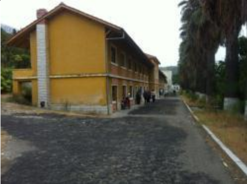
QTTB Building Lushnje