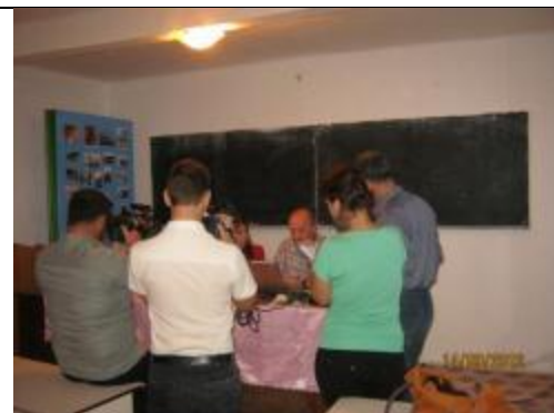
Providing interview to TV stations