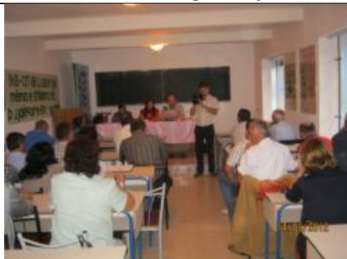
TV4 Plus filming at the meeting