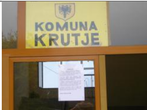
Notice posted in commune July 25 th 2012