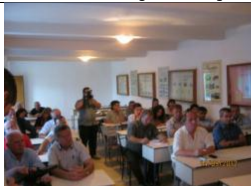
TV7 filming at the meeting