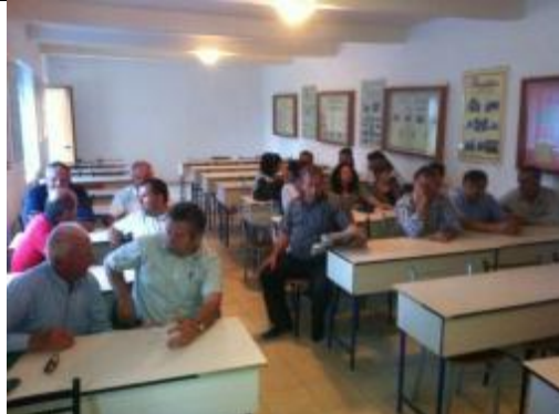
Public assembling for meeting