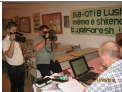
Providing interview to TV stations