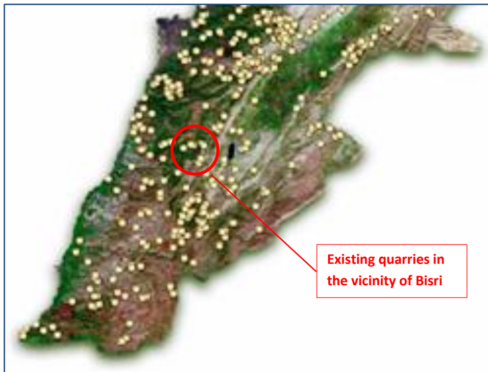
Figure 1: Location of Quarries in the Vicinity of Bisri

The contractor will procure the remaining 20% of materials (mostly anticipated to be riprap materials) from existing commercial quarries. Lebanon has a large number of commercial quarries; all of which have been subject to a permit from the Ministry of Environment. Bisri is well located to take advantage of quarries in the foothills south of Damour and within the Nahr Awali Valley downstream of the dam site. Quarries in the vicinity of Bisri are shown in Figure 1.