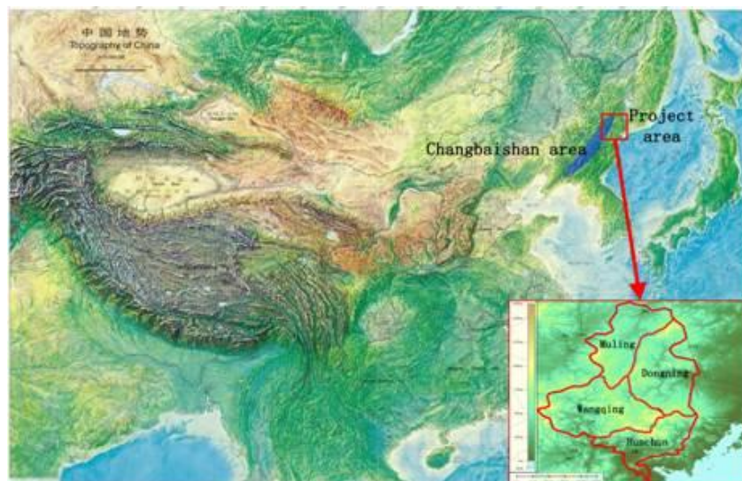
Figure 1: Geographic Location of the Project

In order to promote the conservation of the North-eastern Tiger and protection of its habitat, the State Forestry Administration in associate with World Bank applied for a GEF supported Landscape Approach to Wildlife Conservation in Northeast Project and the application was in principle approved. The project will be implemented mainly in the north eastern area of China which covers the bordering areas of Heilongjiang and Jilin Provinces and closely bordered with far-east of Russia and the northern part of North Korea (see Figure 1 on geographic location of the project). The project will concern Hunchun and Wangqing Counties of Jilin Province, Dongning and Muling Counties of Heilongjiang Province 1 , in total 13879.26 km 2 (see Figure 2 on distribution of project components). Total investigation of the project is 18 million USD including 3 million GEF funds and 15 million of domestic matching. The project will be implemented under administration of the Forestry Department of Jilin Province, the Forestry Department of Heilongjiang Province and the Heilongjiang Forestry Industry Administration.