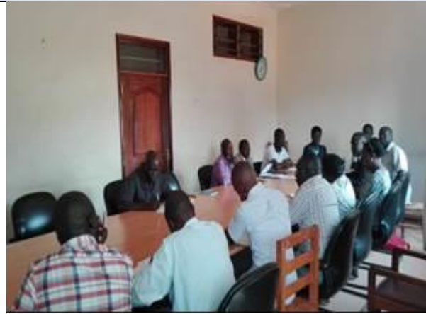
Photo 2: Meeting with some of the district officials in Gulu