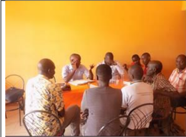
Photo 1: Meeting with the key informants in Kamdini