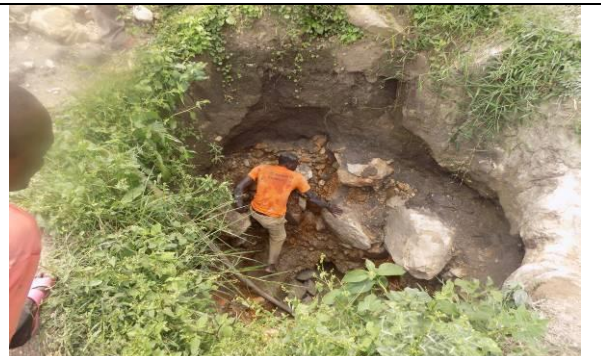
Photo 6: One of the potentially affected sites that might affect artisanal gold miners in Buhweju, Rujunga village.