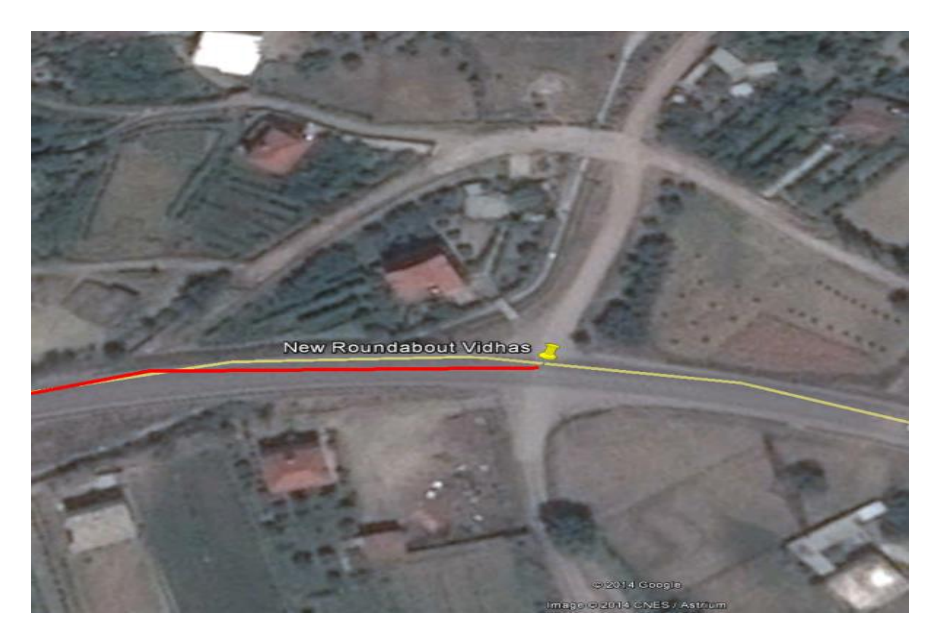
Figure 3–Location of the proposed roundabout in Vidhas