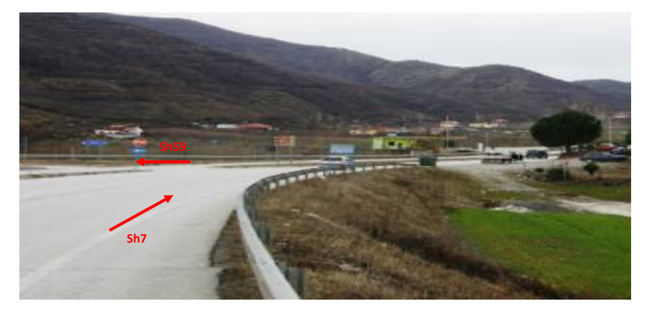
Figure 4 - Location of roundabout in Paper