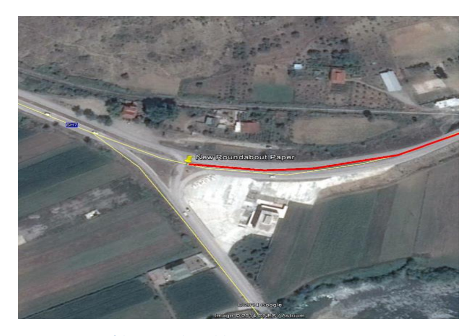
Figure 2–Location of the proposed roundabout in Paper