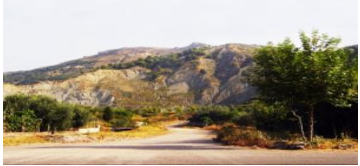
Figure 5 - Location of roundabout in Vidhas

The above proposed interventions represent just a proposal advanced by the Consultant.