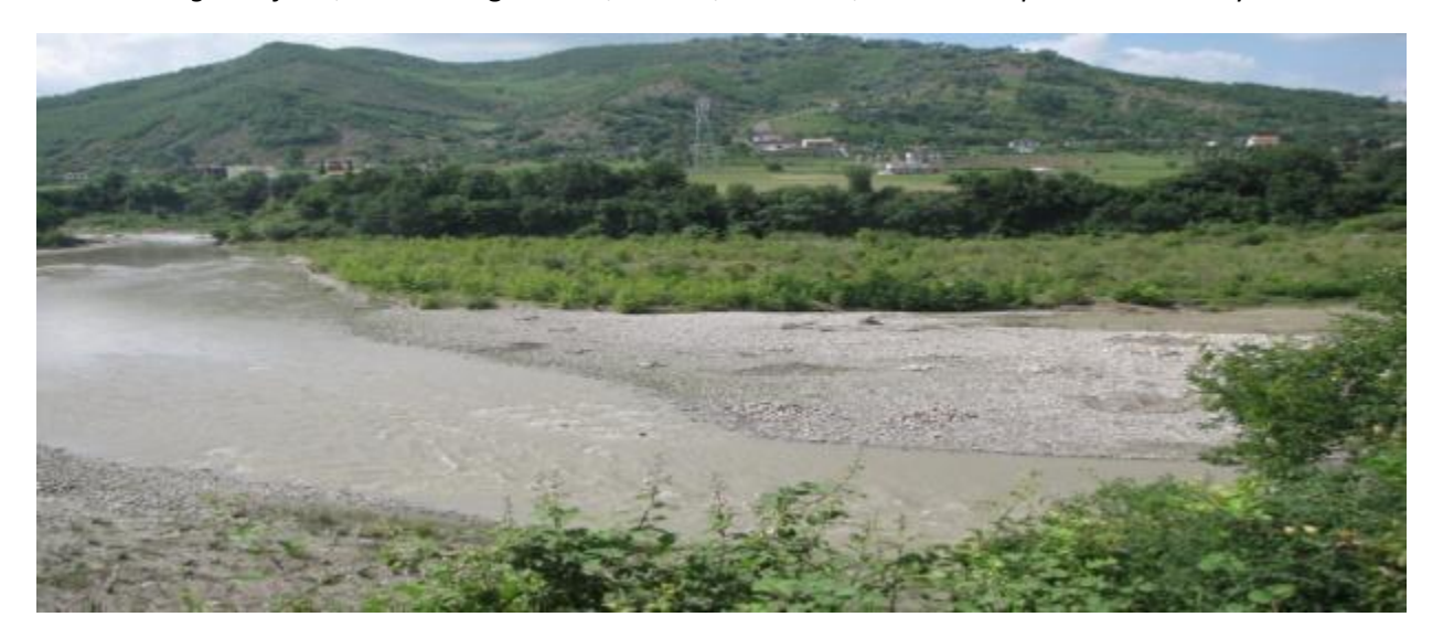
Figure 6 - Salix alba and Populus alba galleries of the Shkumbini River

The presence of Shkumbini river and Paper stream, aquatic habitats, freshwater marshes and riparian forests supporting high floral and faunal biodiversity give to the region a moderate importance. Patches or small areas of this habitat type we can found following the Shkumbini River flows. This very open vegetation, colonizing poorly stabilized alluvial deposits periodically flooded, is characterized by dominance of the Salix alba, Alnus glutinosa, Platanus orientalis, Tamarix parviflora. The accompanying flora include: S. elaeagnos, S. purpurea, Populusnigra, Phragmitesaustralis, Typhalatifolia, Lythrumsalicaria, Menthaaquatica, Rubusulmifolius, Populus alba, Arum italicum, Hedera helix, Calamintha grandiflora , etc. Among mosses, lichens, and ferns, Pteridiumaquilinum is oftenly abundant.