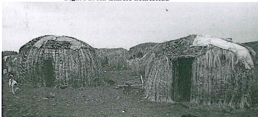
Figure 2: An Elmolo homestead