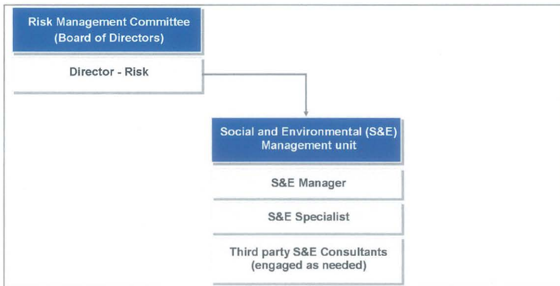
Figure 4.1: Organisation structure for Social and Environmental Management System

28. Projects that have significant S&E impacts may require additional expertise and special attention. For such projects, the SEU may engage third party S&E Consultants to support the activities listed in section 4.2 of this manual. The following figure illustrates the structure of the SEU.