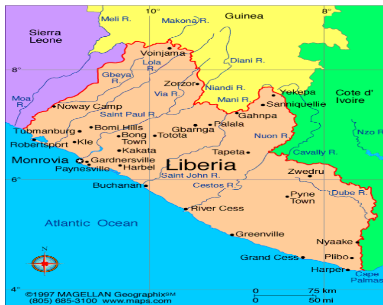
Figure 2: Relief Map of Liberia

Air and Climate. In Liberia, the climate is tropical, hot, and humid all year round, with a rainy season from May to October due to the African monsoon, and frequent rains in the other months, except in the short dry season that runs from December to February, which is more marked in the north. Along the coast, the rainfall exceeds 3,000 millimeters (118 inches) per year. In the northern part of the coast, in Monrovia, rainfall reaches as high as 5 meters (16.5 feet) per year. In the interior, precipitation is less abundant, and drops in some areas below 2,000 mm (79 in) per year.