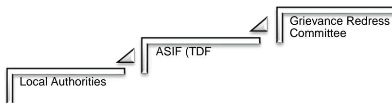
Figure 2. Grievance Redress Mechanism

ASIF (TDF) in order to provide a direct channel to the affected PAPs and community members for approaching ASIF (TDF) and have their grievance recorded and redressed in an appropriate time frame will establish a first step of grievance redress mechanism in cooperation with Local Authorities. Prior to RAP preparation as well as Construction works, ASIF (TDF) will inform the beneficiary community about the grievance redress mechanism and provide contact details of persons responsible for grievance collection and response in the community.