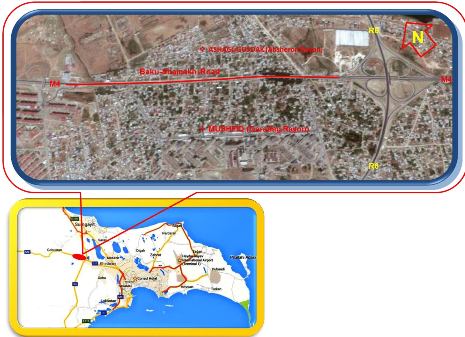
Figure 1: Map of the Project Road