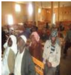
Gera Woreda Men and Women FGD Participants- PIC-1