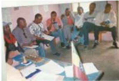
Dodola Woreda Consultation Participants