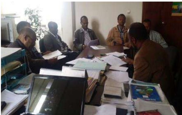
Oromia BoA Expert Consultation