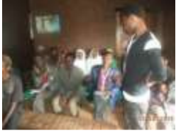
Yayu Community Consultation-1