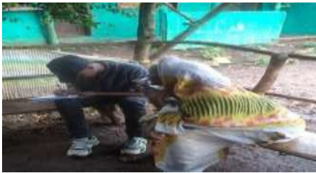
Jibat Key Informants-1