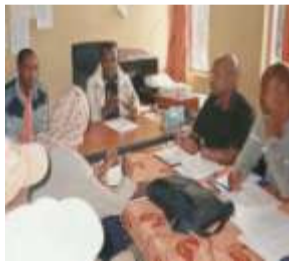
Dodola Woreda Consultation Participants-2