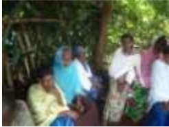
Gera Woreda Men and Women FGD Participants- PIC-3