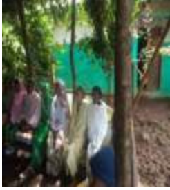
Gera Woreda Men and Women FGD Participants- PIC-2