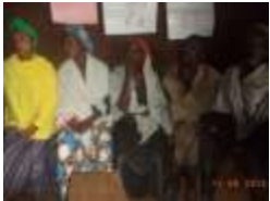
Yayu Community Consultation-2