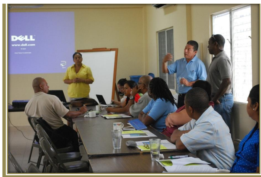
Figure 3: Mayan Translator conveying message in Kekchi for the community representatives

The consultation was conducted in four languages: English, Kekchi, Mopan and Spanish.