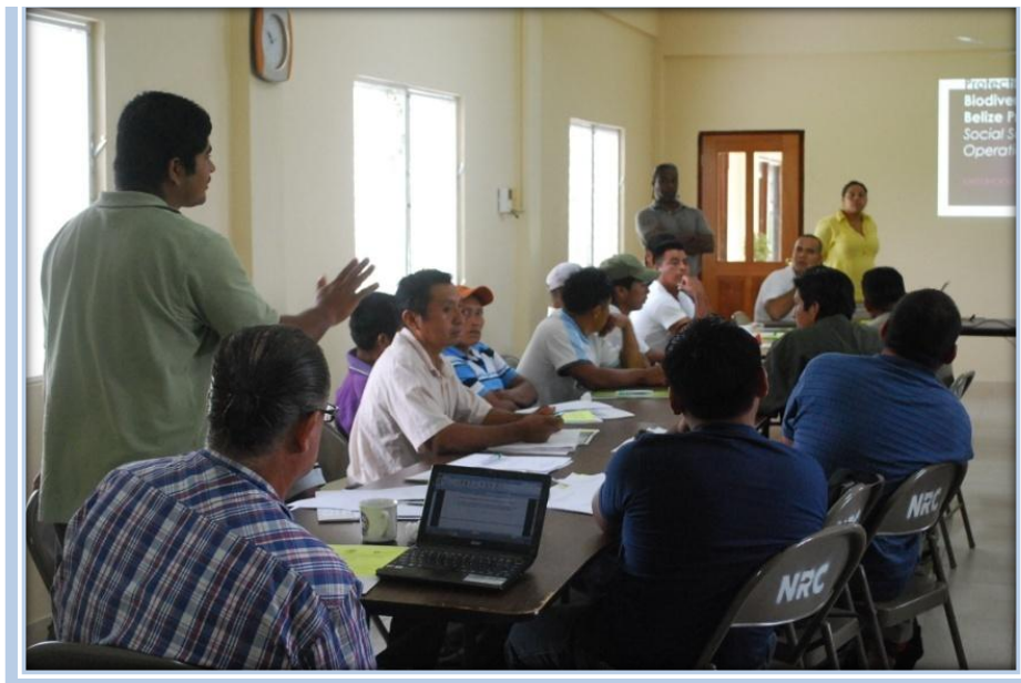
Figure 4: Representative from TIDE expressing his support for the project