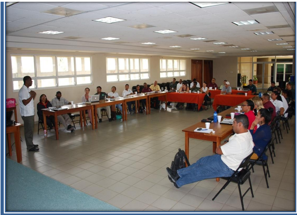
Figure 1: Social Development consultant presenting social assessment

The workshop participants also engaged in group exercises to identify community based activities within and around the target sites.