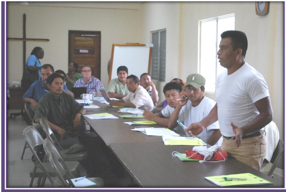
Figure 5: Alcalde of Indian Creek voicing his concern regarding demarcation of protected areas boundary

Golden Stream is only 15 minutes away from the protected area. Big Falls village, Hicatee and Silver Creek are also users. The project needs to take closer look at communities that may be using the areas. It was explained that social assessments will be conducted to determine level of use and final listing.