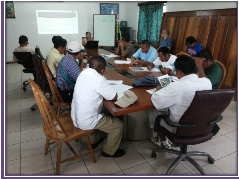
Figure 8: Participants who attended consultation