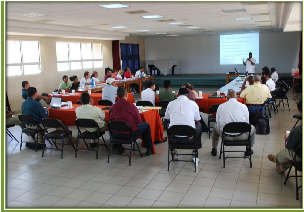
Figure 2: Participants at the validation workshop