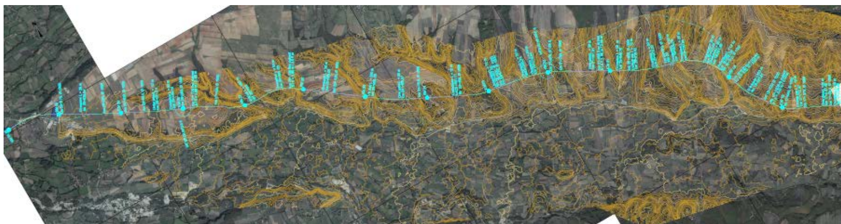
Figure 3 Outline of the Section km17+000-km 31+000