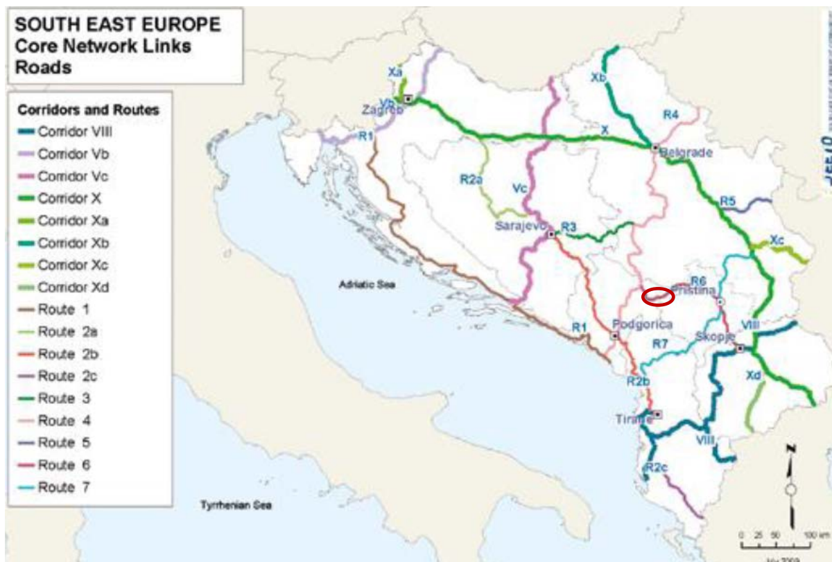
Figure 1 Location of the Project on SEETO Route 6 B

The Ministry of Infrastructure (MI) of Kosovo* is planning to undertake a Project to improve part of the national road N9 by constructing an offline Motorway section Kijevë – Klinë - Zahaq (31km). The Project is in line with the overall plan for improving the national road network, outlined in the national Multi-Modal Strategy (2012-2021) and Action Plan (2012-2016) 1 , The Project is part of SEETO 2 Route 6 B (Figure 1).