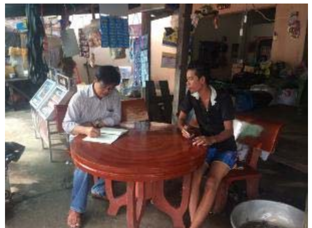
Interview local people