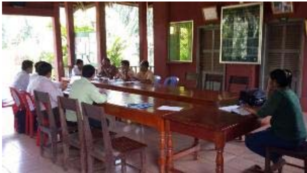
Discussion with local authority-Snuol