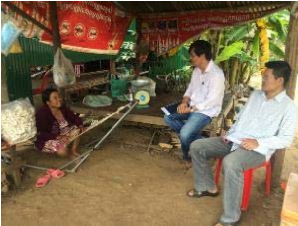
NR7- Interview with local resident