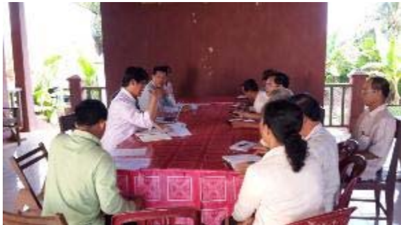
Discussion with local authority-Memot