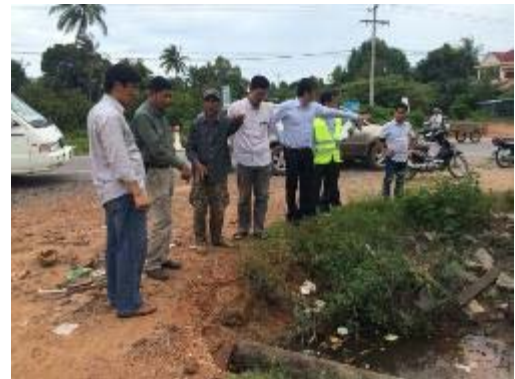
Visit side drainage-flooded area