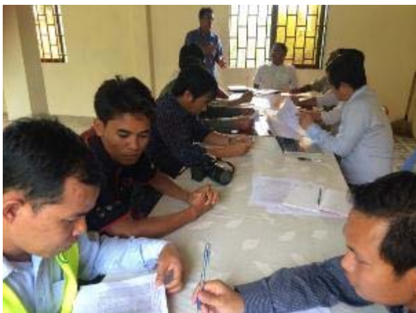
Meeting at Koh Toch commune