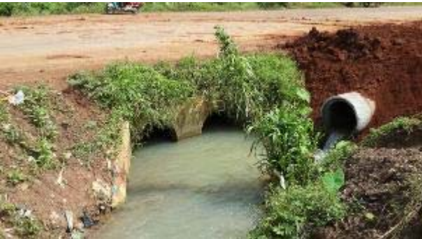
Cross drainage PK206-Flooded road