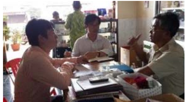
Discussion with commune Chief – Da market