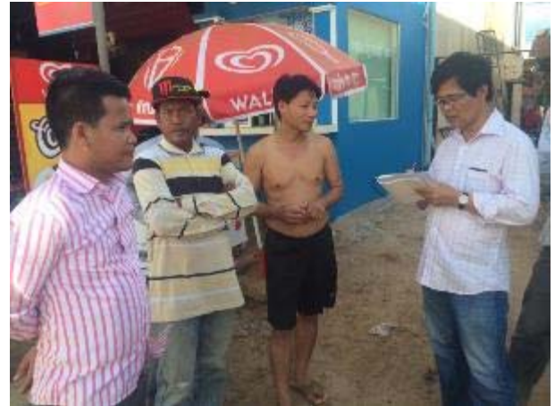
Interview people along the road