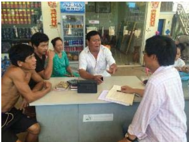
Business disruption discussion