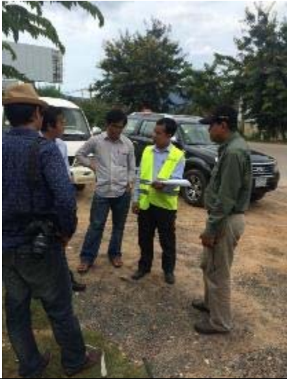
Discussion of existing pipe clean up