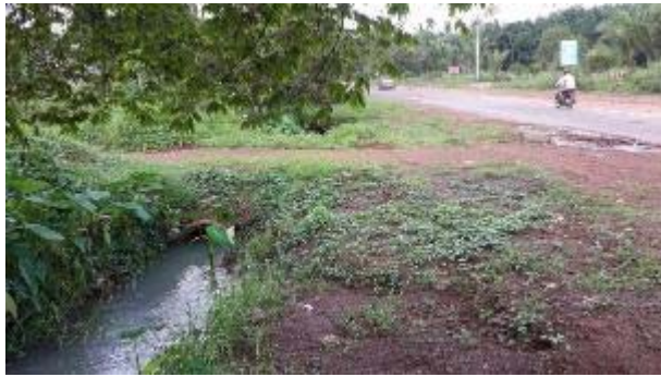
Existing small drainage to be enlarged