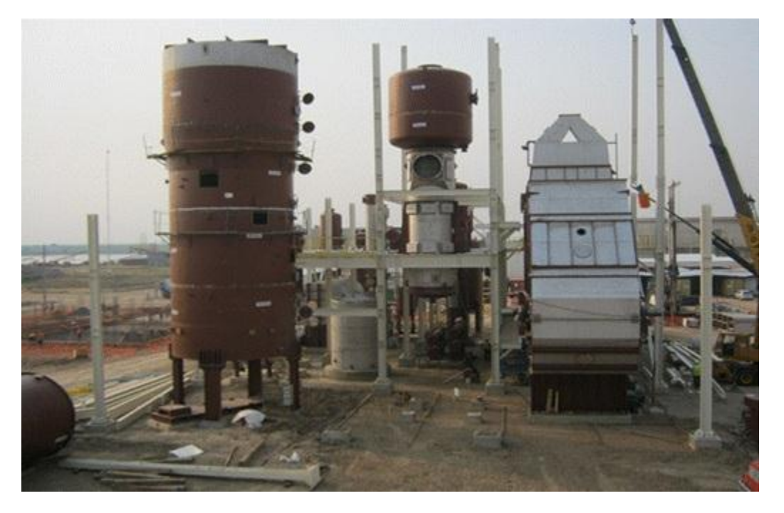
ANNEX V: View of the Extraction Plant (Oct., 2012)

ANNEX IV: One of two raw material storage buildings under construction (Oct., 2012)