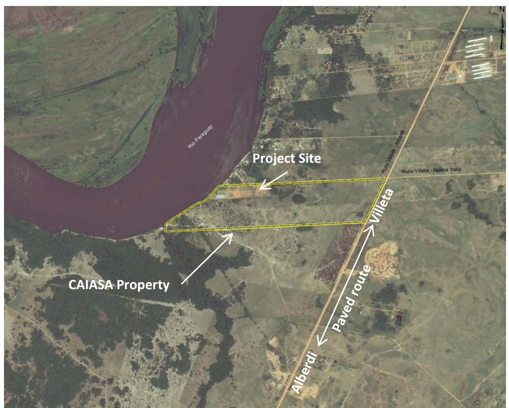
ANNEX II: Project Site