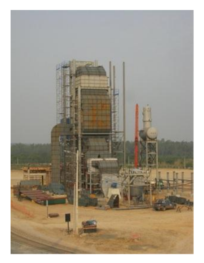
ANNEX VI: View of the biomass boiler (Oct., 2012)