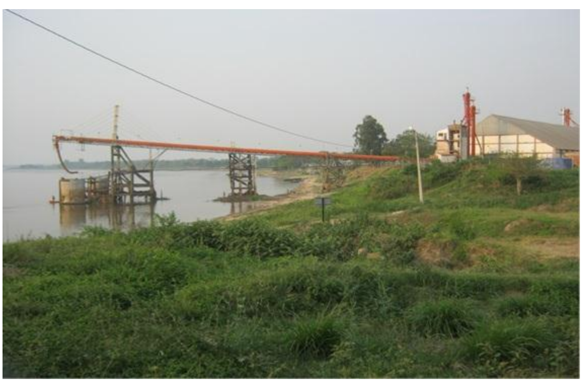
ANNEX VII: View to the existing port facility (Oct., 2012)