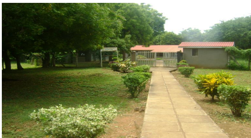
Figure 1: Part of Malindi hospital compound

The proposed laboratory is within the compound of Malindi district hospital which is located within Malindi town in Malindi District. The baseline study below covers within the scope of the project area.