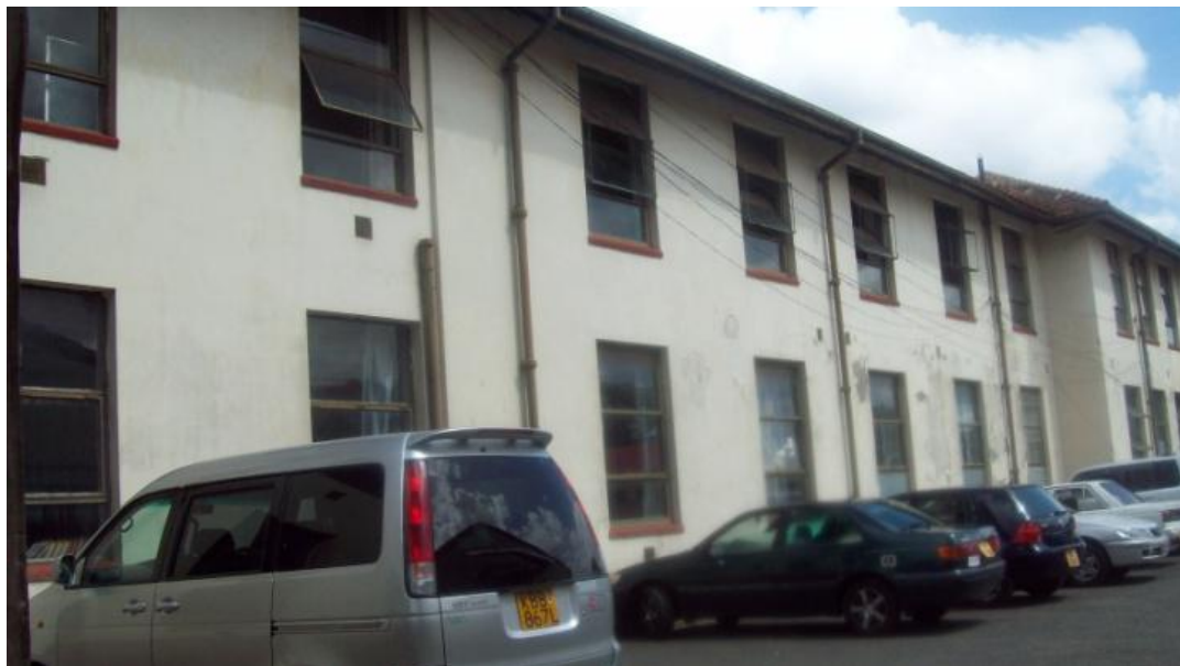
Figure 1: part of the National Public Health Laboratory Services building

The National Public Health Laboratory Services building is located within the greater Kenyatta National Hospital compound in the neighbourhood of KEMRI, Welcome Trust, National Blood Transfusion Centre and the maintenance building. The site has an efficient connection of road network and is served by electricity from Kenya Power, water and sewer by the Nairobi Water and Sewerage Company (NW&SC).