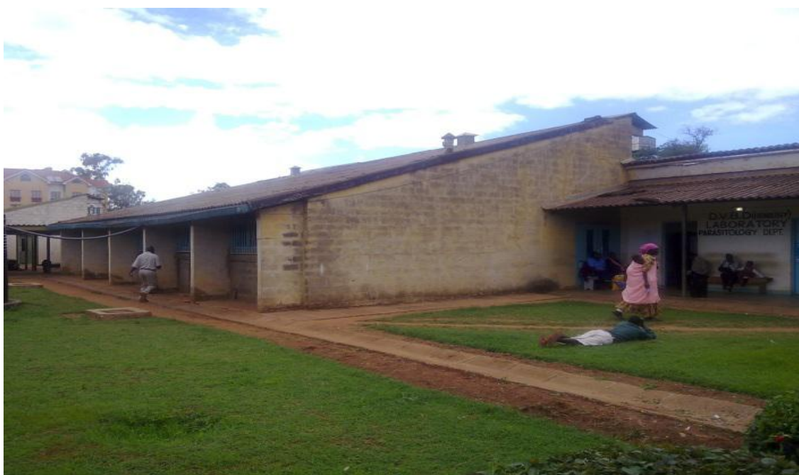
Figure 1: Machakos hospital showing the current laboratory.

The proposed laboratory is within the compound of Machakos district hospital which is located within Machakos town in Machakos District. The baseline study below covers within the scope of the project area.