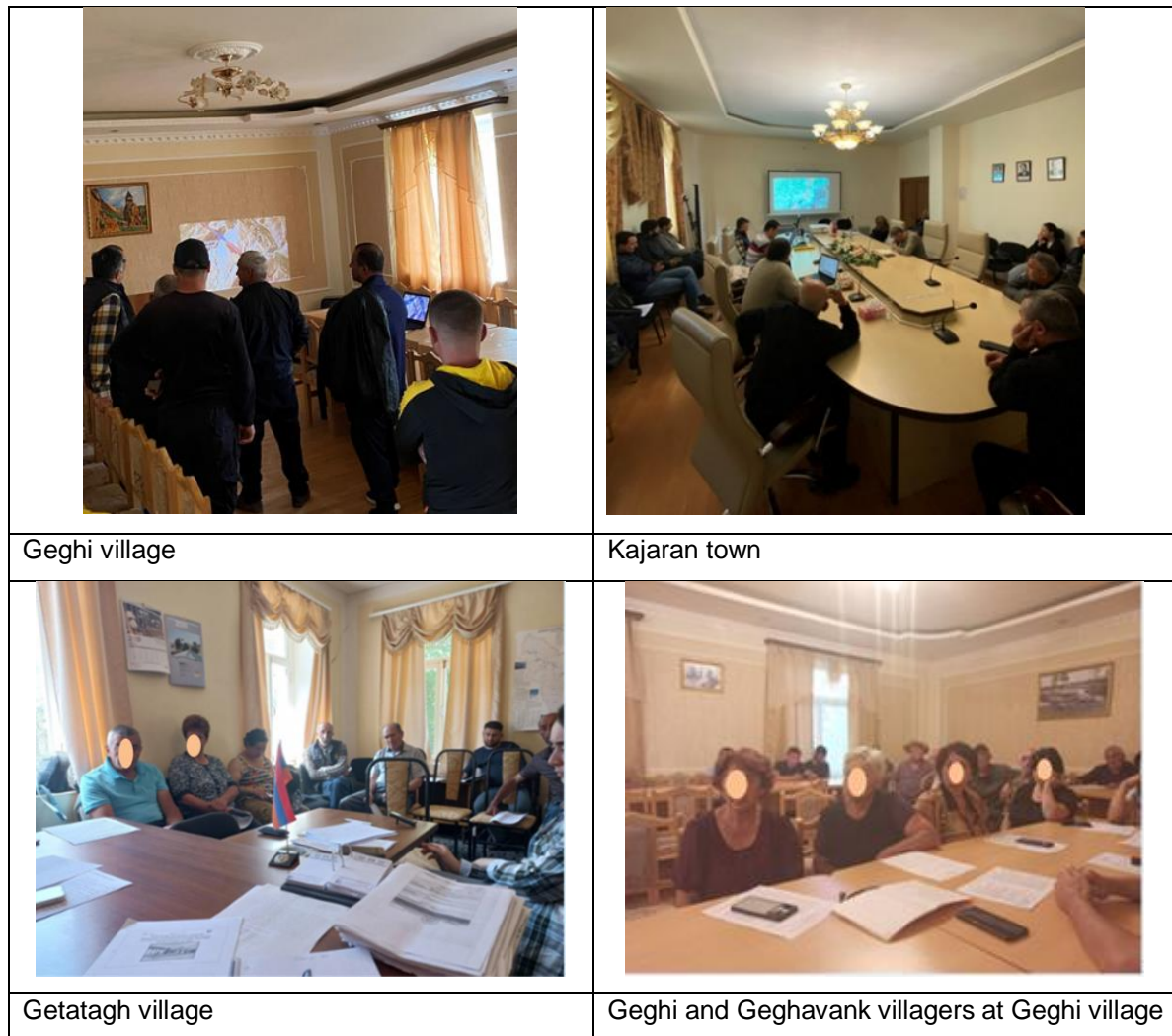
Figure 3. Photos of some ESIA scoping consultation meetings (first four photos) and Resettlement Plan pre-survey meetings (last two photos) 30

Information about the completed events and photos from the meetings were posted on the Consultant’s website and LinkedIn page 31 .