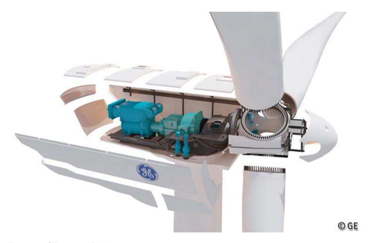
Figure 4 - GE 2.75-120 Turbine

Electrawinds is installing wind turbine model GE 2.7-120 supplied by GE Energy for the production of clean electricity by converting wind energy into electrical energy. These wind turbines have a capacity of 2.75MW and the maximum height of the turbine including the rotor blade is 169m. These turbines are smaller than the generic units considered in the original EIA. The type of turbine installed is shown in Figure 3 below: