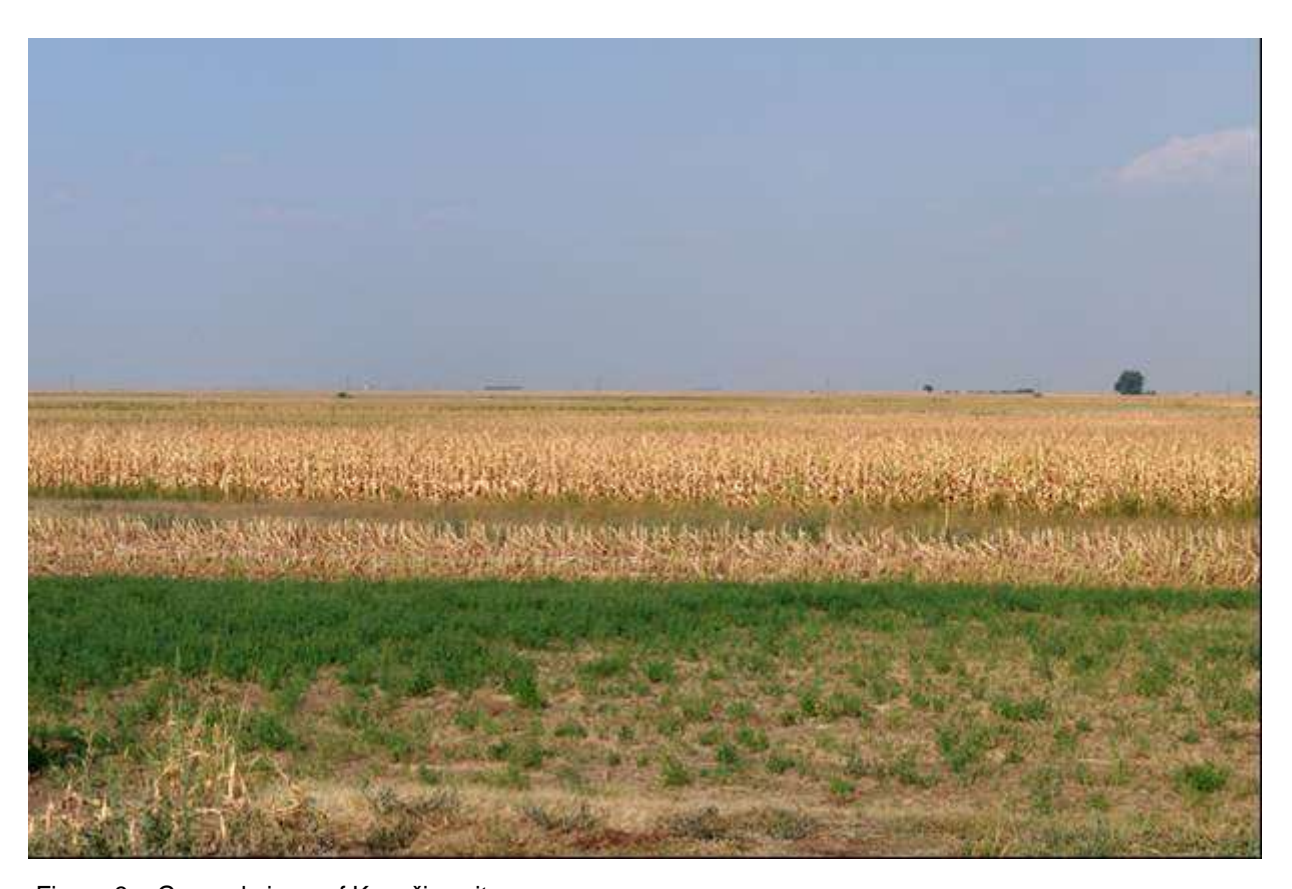
Figure 3 – General views of Kovačica site

There are no nationally protected areas within the site boundary. There is a small area of locally designated ecological network in the northeast corner of the site, located along the Jarkovacki Road (KOB07a and KOV07b).