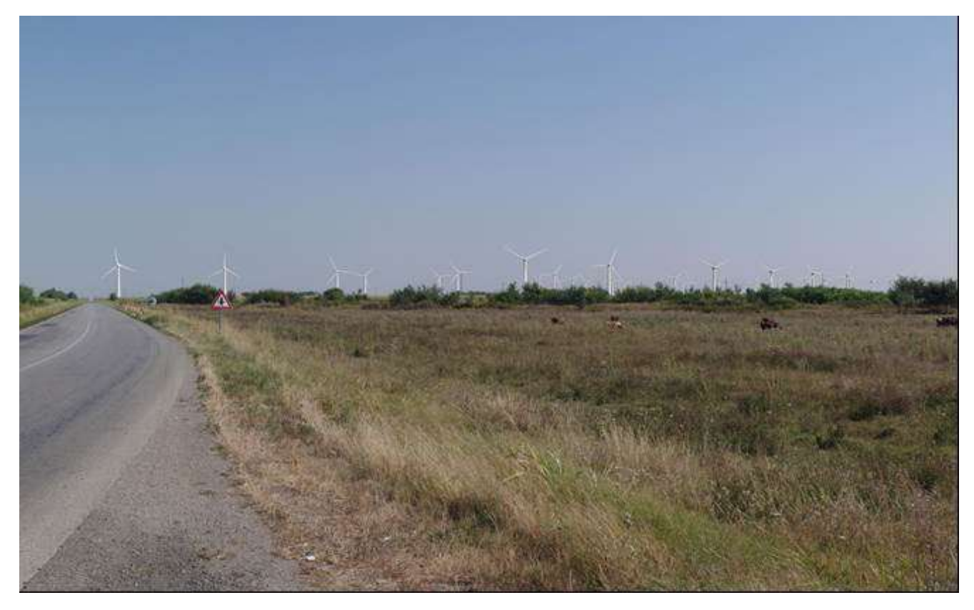
Figure 6: Visualisation of site from Crepaja roadside

There are no existing wind farms within sight of the proposed development but proposals for a number of other similarly sized developments nearby. The nature of wind turbines means that there is little mitigation possible to reduce their visual impacts. The introduction of wind turbines would therefore have an impact on the landscape character of the site and surrounding visual amenity. This impact would last for the operational period of the wind farm and be reversed on decommissioning.