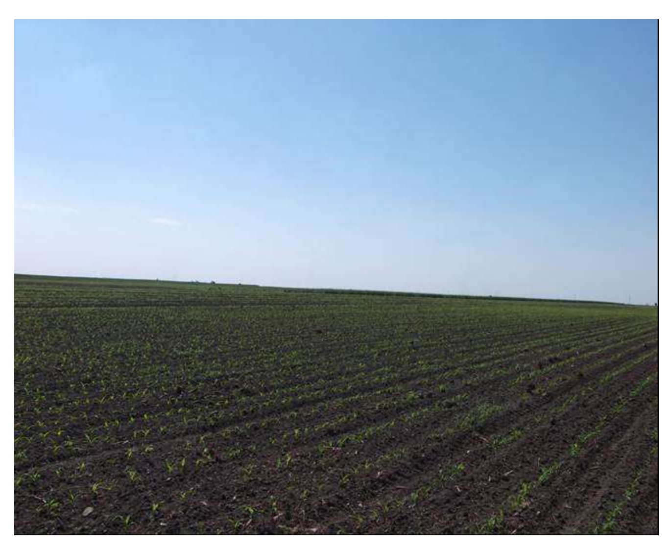
Kovačica Wind Park, Serbia Non-Technical Summary