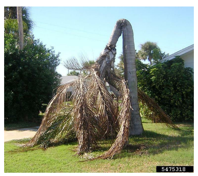
Plate 5: Stem bleeding and eventual trunk collapse