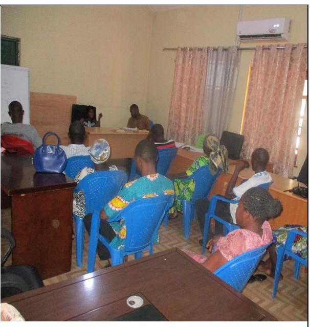
Engagement with farmer based organisations – Asamankese, Eastern Region.