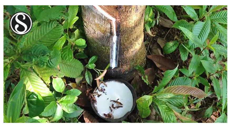
Plate 8: Fungus causing stem canker disease