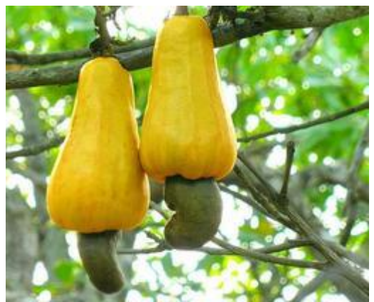
Plate 4: Cashew foliage (L) fruit (R)