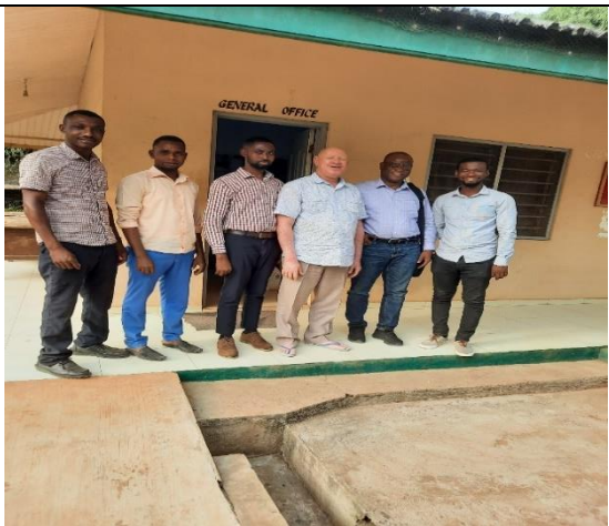
Engagement with Wenchi Agriculture Station Officer In-Charge of Crops