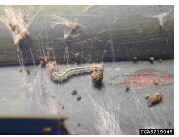
Plate 7: Leafroller (Hedylepta blackburni) adult (R) and Lavae feeding on leaves