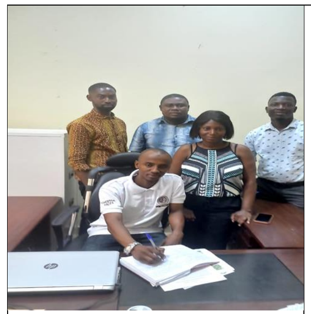
Engagement at Cocoa Health and Extension Division (COCOBOD) District Office – Asamankese, Eastern Region