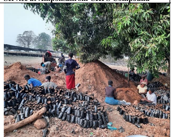
Women undertaking potting in preparation for cashew seedlings at Wenchi Agriculture Station