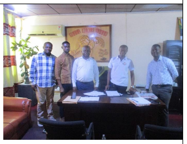
Engagement at Cocoa Health and Extension Division (COCOBOD) Eastern Regional Office