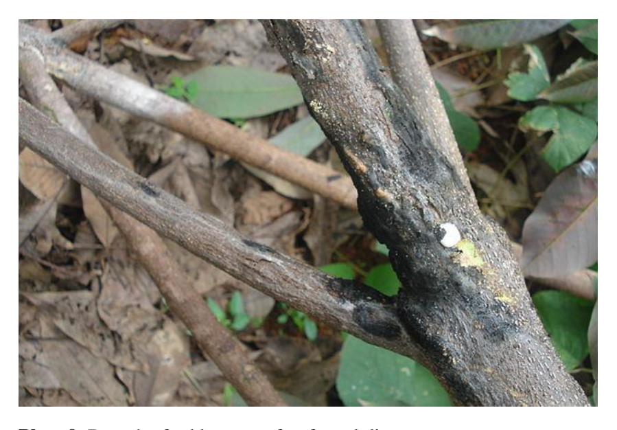
Plate 9: Branch of rubber tree after fungal disease