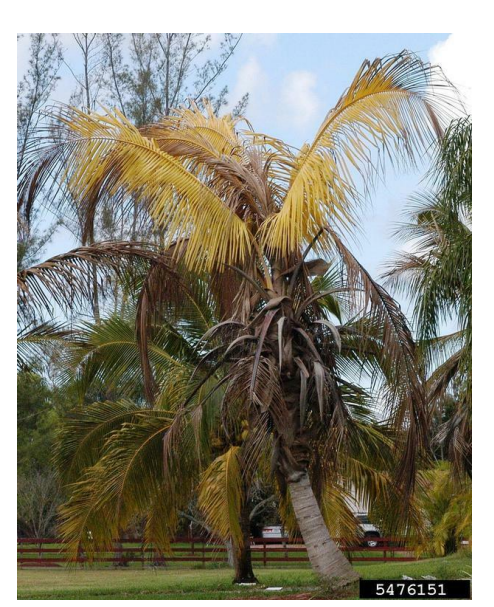
Plate 6: Lethal yellowing infected coconut