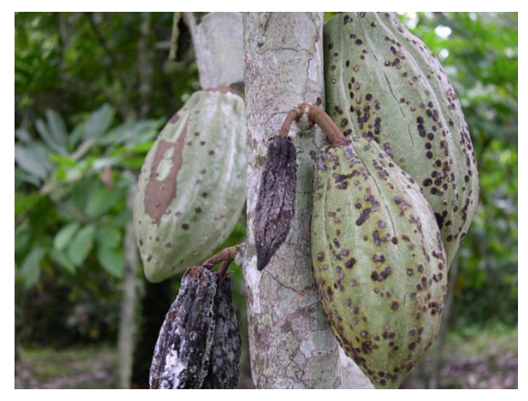
Plate 1: Symptoms of black pod disease