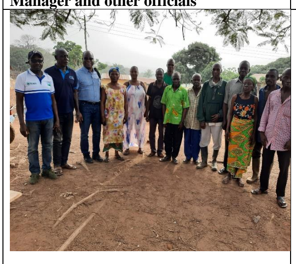
Engagement with Wurompo Cashew Farmers and Community Development and Social Welfare