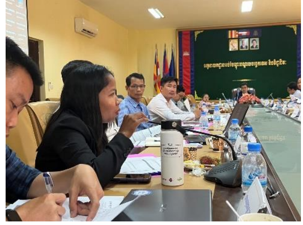
Discussion and Consultation