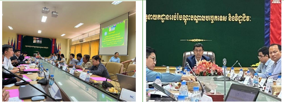
Discussion and Consultation