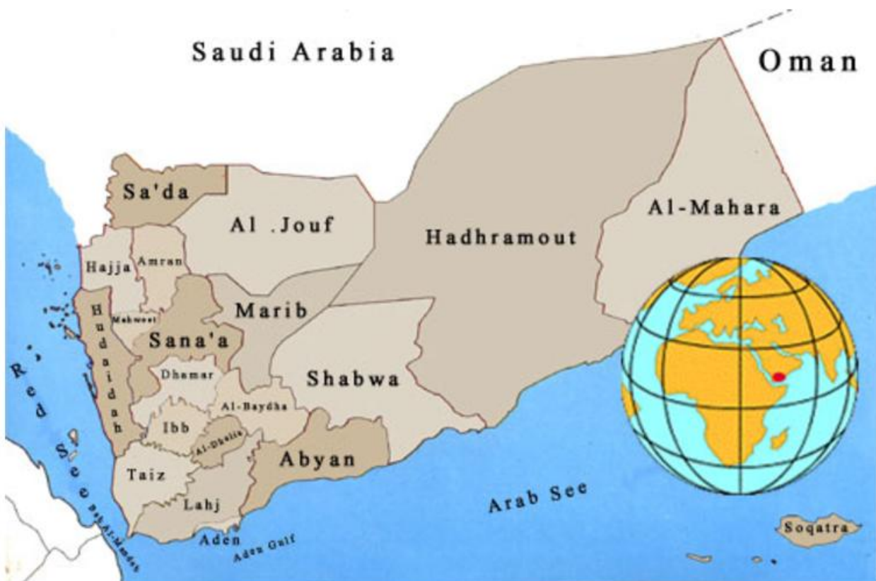
Figure 1: Map of Yemen

Basic social services, including education, health, and water, are collapsing in several areas of the country and humanitarian needs are on the rise. The overall livelihood and socio-economic situation is not showing any signs of improvement and, combined with the reduction and suspension of government salaries, is most likely to have a substantial negative impact on the overall food security situation in the country.