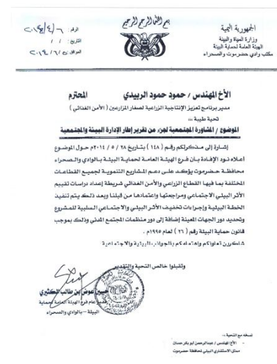
Fig. 1. Letter from Hadhramout EPA

The letter from EPA – Hadhramout insisting on conducting ESIA on each project for approval.