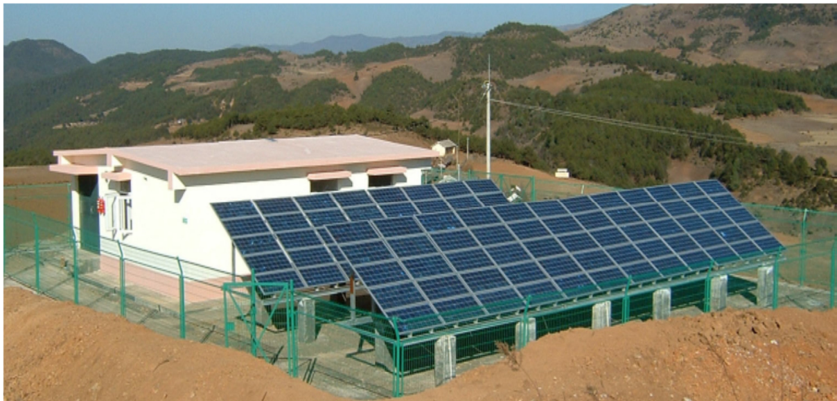
Figure 2 Solar PV Array and Battery/Genset Building