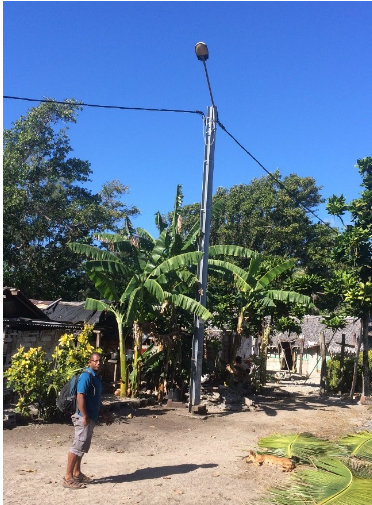
Figure 3 Power Pole and Distribution Lines