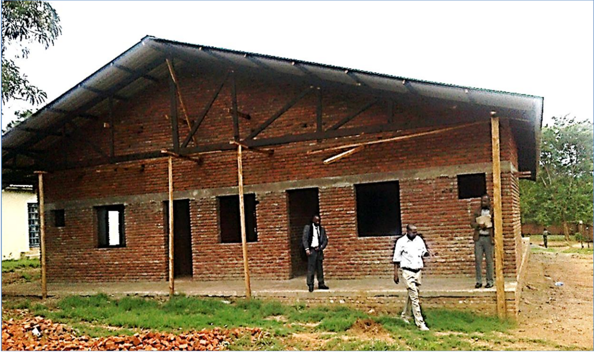
Figure A7.2: The Ebola facility under construction at Kamuzu Central Hospital