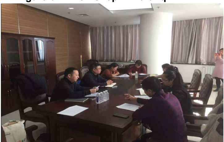
Figure 6-9 Workshop in Economic Development Zone