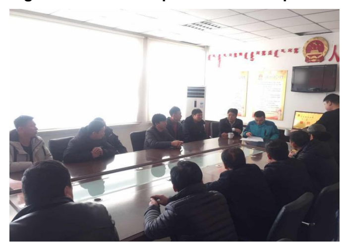
Figure 6-4 Workshop in Kezuozhongqi