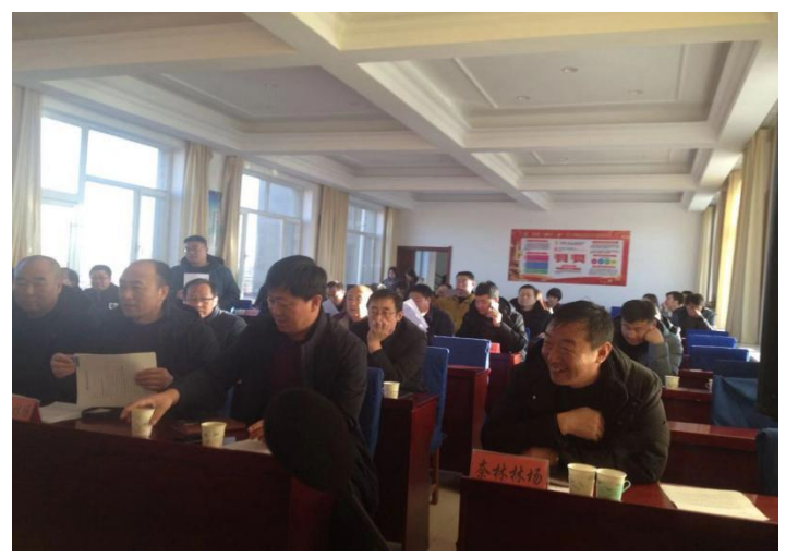
Figure 6- 6 Workshop in Naimanqi