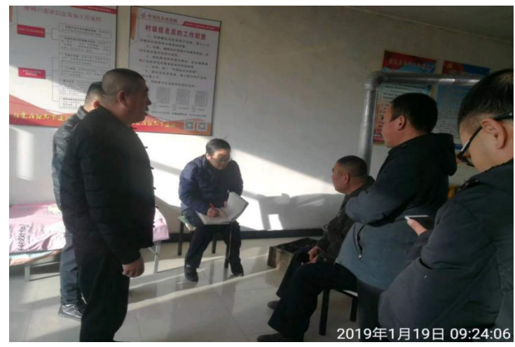
Figure 6- 7 Workshop in Kulunqi