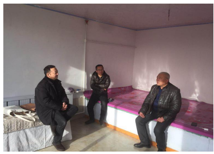
Figure 6-3 Interview with afforestation in Horqin District