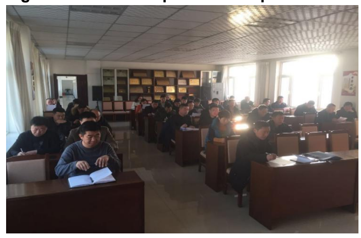
Figure 6-8 Workshop in Kailu County