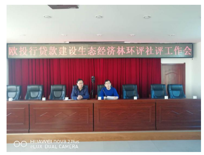
Figure 6- 2 Workshop in Kezuo Houqi