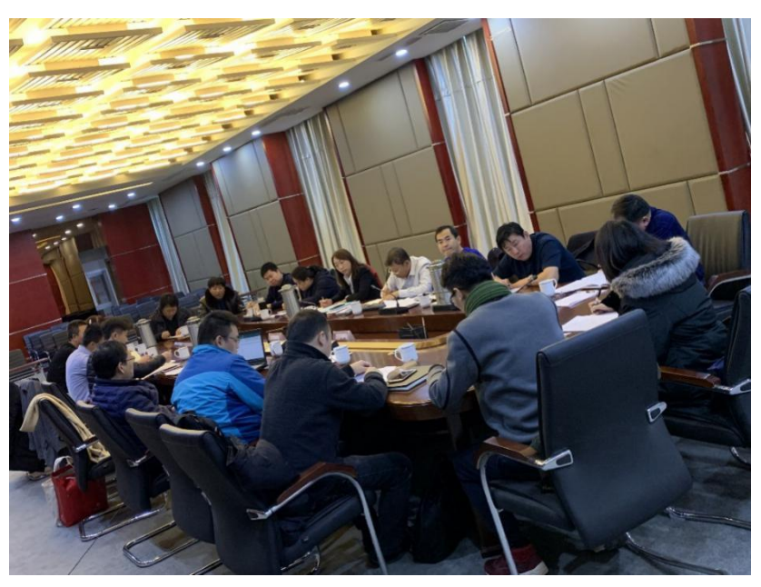
Figure 6- 1 Forestry and grassland bureau Workshop in Tongliao