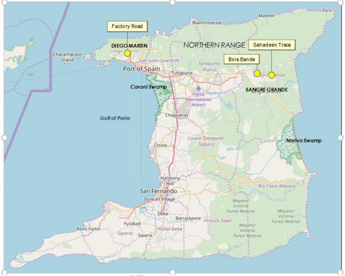
Figure 1 : The Sample Sites for Urban Upgrading

Ilesi Consultants Limited prepared an Environmental and Social Assessment (ESA), and this ESMP serves as an action document arising from that ESA. The aim is to guide all parties involved in the proposed works, so that they fully understand the environmental and social mitigation measures, as well as the monitoring which must be done. The objective is to ensure that mitigation and monitoring are undertaken in a timely fashion.