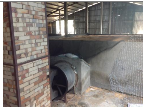
Chimmeney within the drying facility