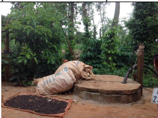
Coffee garden mixed with peper, cashew nuts etc.