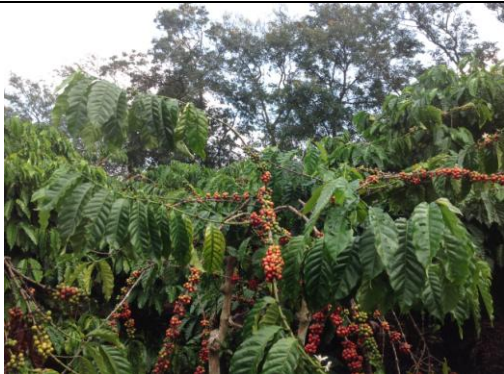
Spaning tree with yellow flower, a native plant specie, has been being planted at interval to provide shades for coffee plants