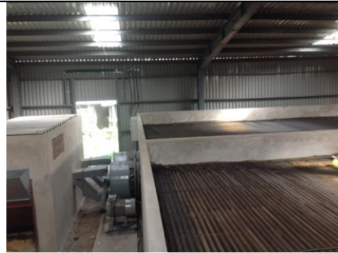
Inside a Drying facility using rice husk for fuel