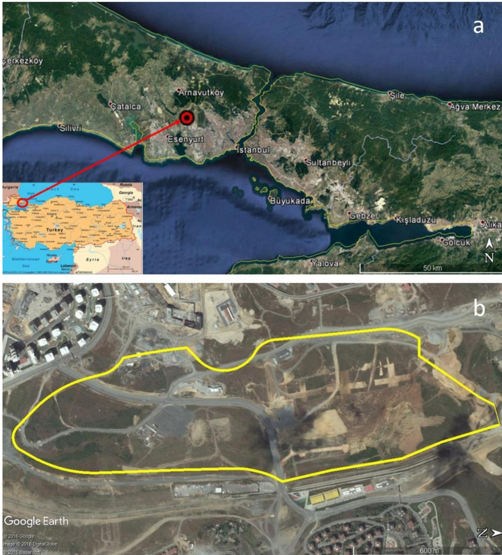
Figure 1-1: (a) Project location within Istanbul province, (b) Project site and its boundaries (yellow line indicates the Project site boundary)

The Project is located in the Basaksehir district of Istanbul province, Turkey. The Project location is shown in Figure 1-1.