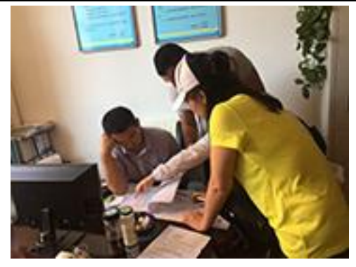
Interview in Dumari Sub-district