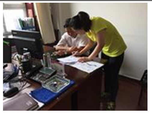
Interview at the Yilihe Sub-district Office