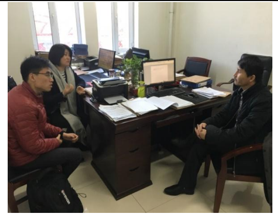
Interview at the municipal ethnic and religious affairs bureau