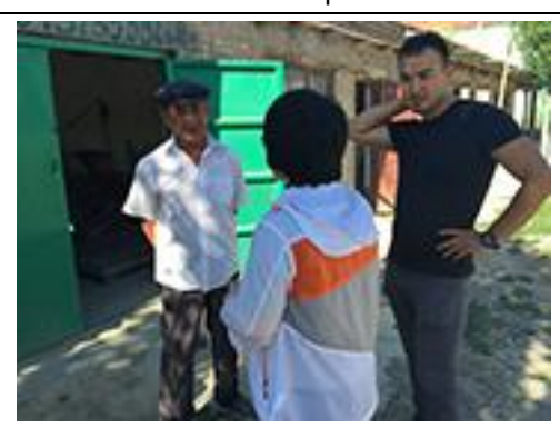
Interview in Kebokyz Village