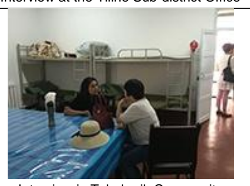
Interview in Tuhukruik Community