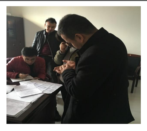
Interview in Baskulk Village