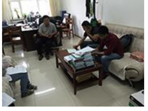
Interview at the municipal poverty reduction office