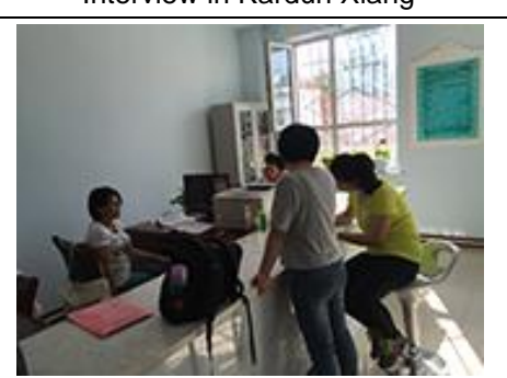
Interview in Bayqk Community