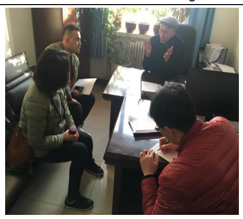
Interview in Yingyeer Xiang