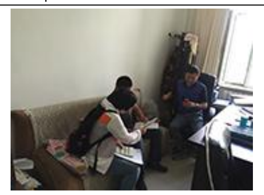
Interview at the municipal civil affairs bureau