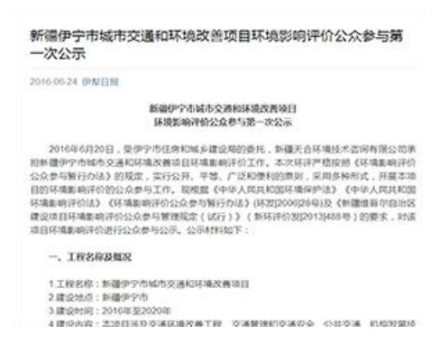
Figure 8-1 Disclosure of Project Information