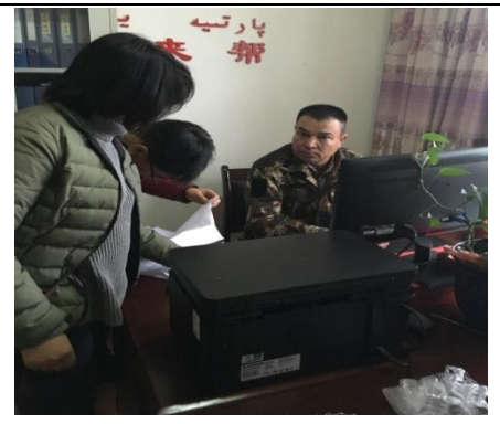
Interview in Dongbazha Village