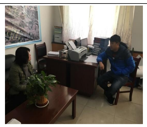
Interview in the cow farm