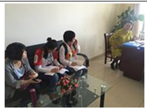
Interview at the municipal women's federation