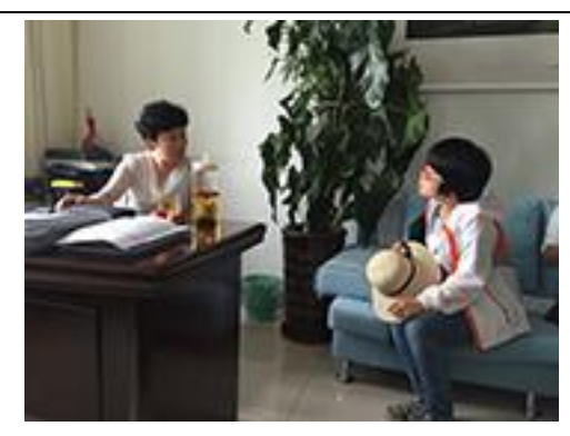
Interview at the municipal civilization office