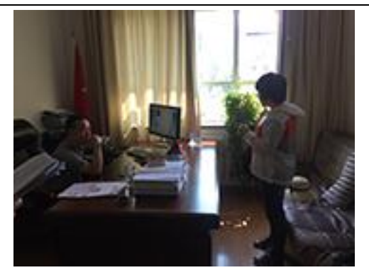
Interview at the municipal disease prevention and control center