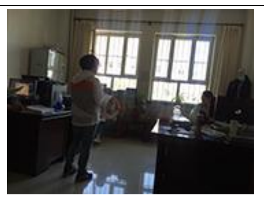
Interview at the municipal educational bureau