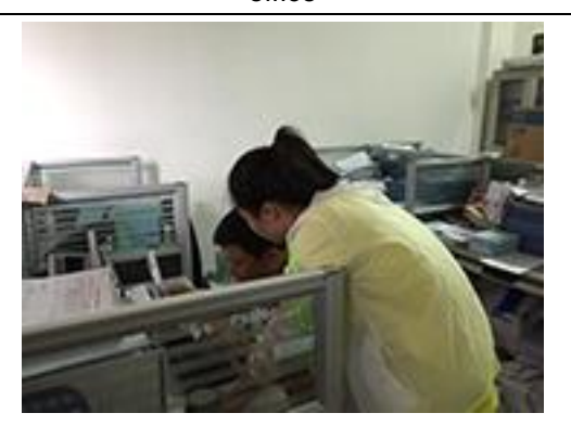
Interview at the municipal ethnic and religious affairs bureau