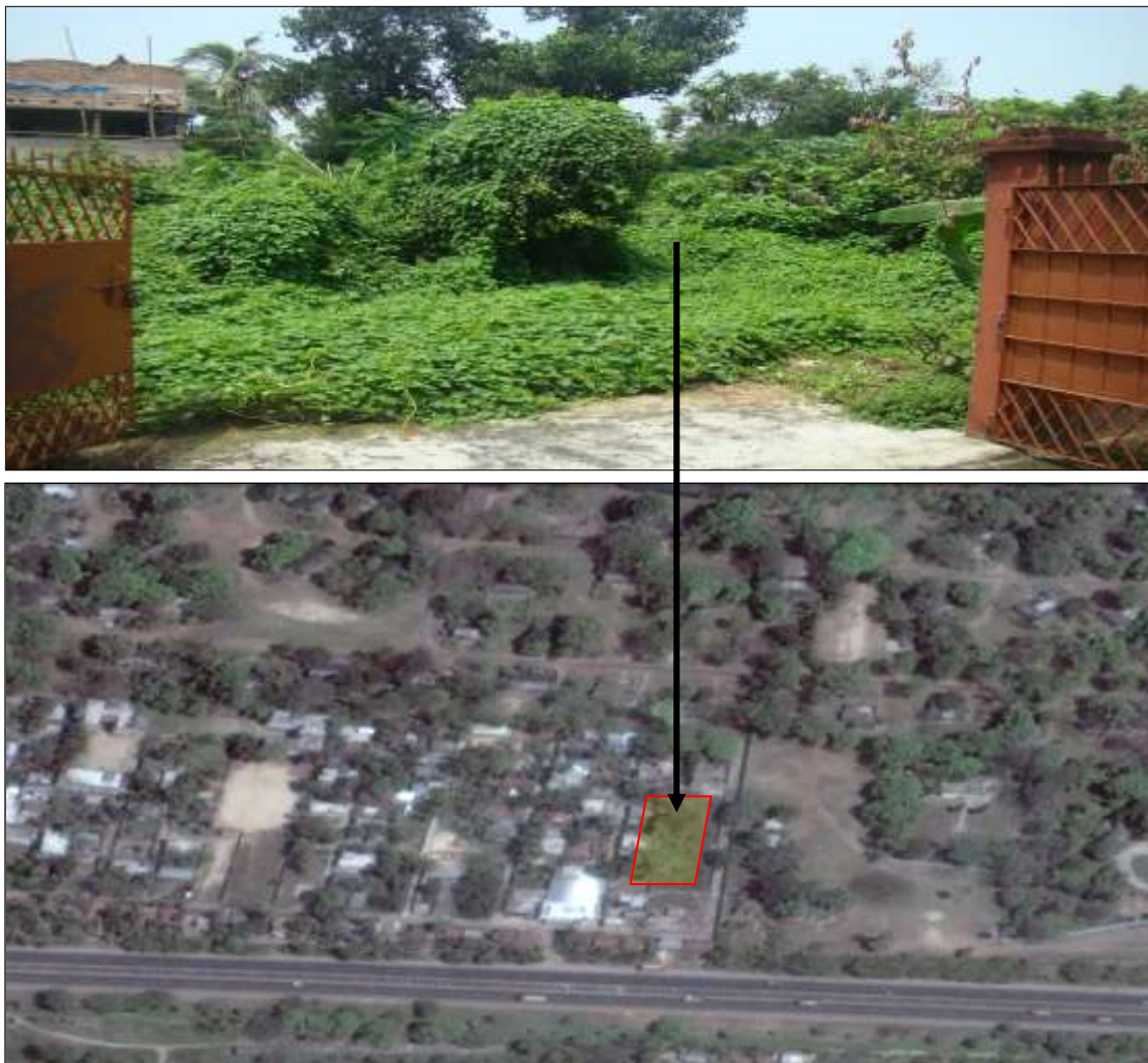
Site for RRNMU – Mouza Gopalnagar BurdwanTown Satellite Imagery showing proposed RRNMU site, Gopalnagar, Burdwan

9. The SRRDA with assistance from TSC conducted social safeguard screening of the proposed site for RRNMU. For the screening purpose a Social Safeguards Checklist was adopted that is presented in the appendices. As RRNMU buildings are proposed in land owned and under possession of Deptt. Of Panchayat and Rural Development, Govt. of West Bengal, there will be no need for monitoring of adverse impacts due to land requirement. However, PIC will provide monitoring support to the SRRDA for issues might arise during execution of the project.