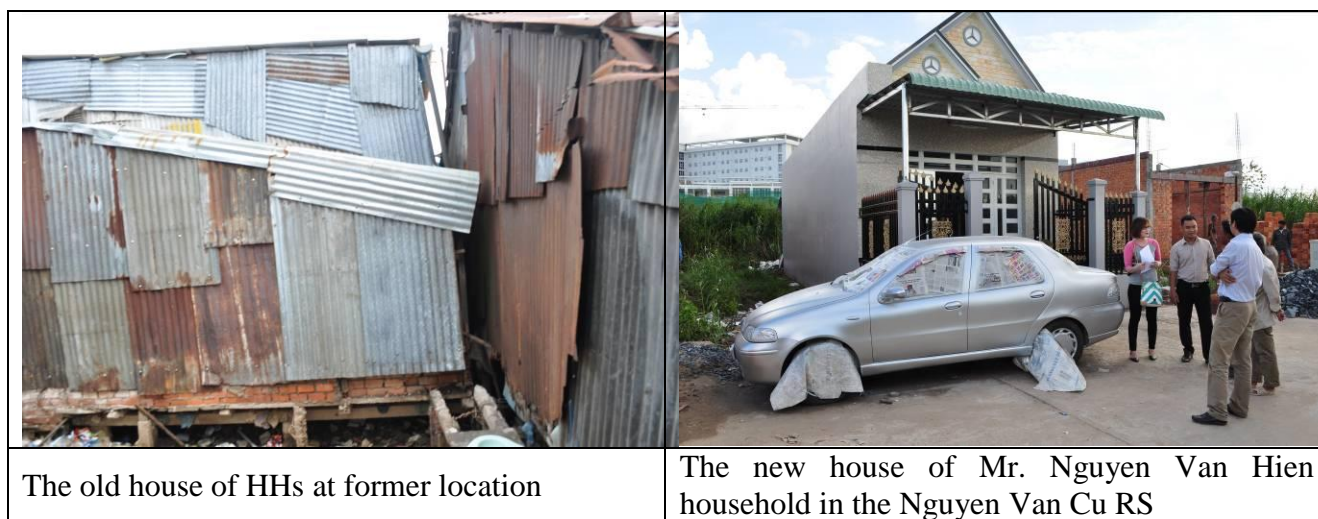
Figure 3. New house of HHs in the resettlement site

The displaced households are mainly households whose house encroached on the river, canal with few infrastructure and very poor sanitation conditions. These HH could build a decent permanent house in the RS while they were living in temporary house in their former location (see Figure 3).