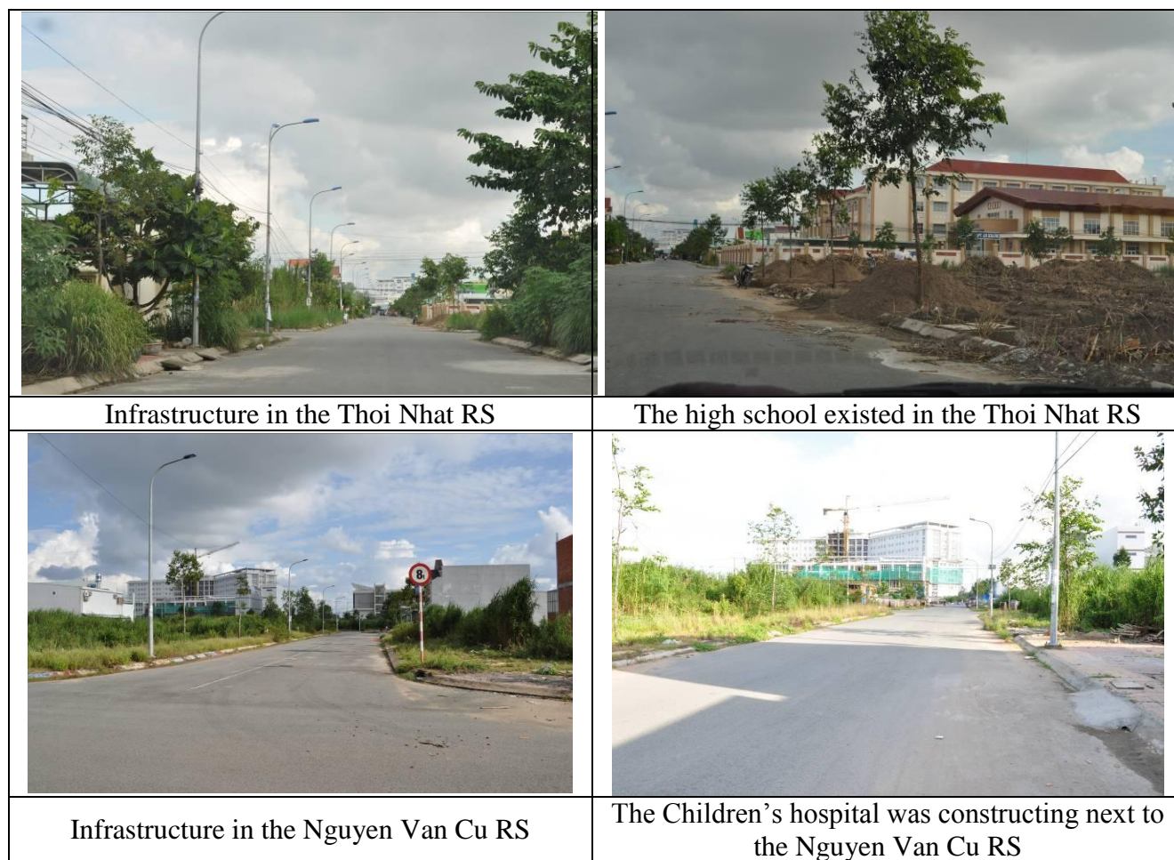
Figure 2. Infrastructure in Resettlement Sites

Affected HH were relocated in two Resettlement Sites (RS): Thoi Nhat and Nguyen Van Cu. Thoi Nhat RS belongs to An Khanh ward, Ninh Kieu district and Nguyen Van Cu RS belongs to An Binh ward, Ninh Kieu district. Both RA are fully services with necessary infrastructures (electricity, water supply, sewage system) to ensure compliance with building standards of the Ministry of Construction of the infrastructure in new urban areas, urban resettlement. Distance from the former residence of the households to new housing in the resettlement site is about 5 – 6km. Infrastructures in the two resettlement sites are better than the former place.