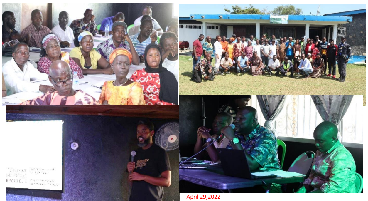
Appendix 8: Photos of Participants