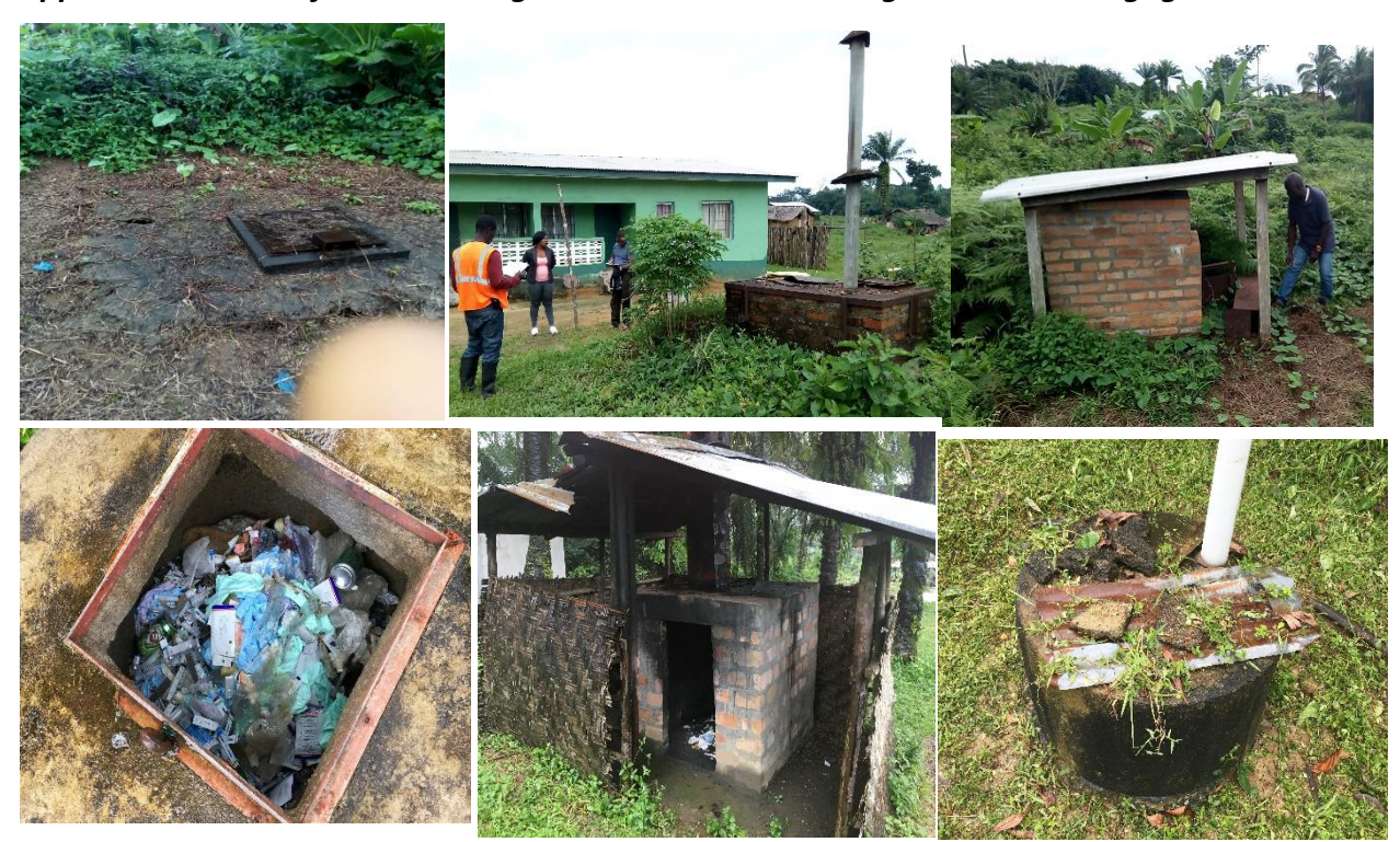
Appendix 6: Views of waste management assessment during stakeholder engagement