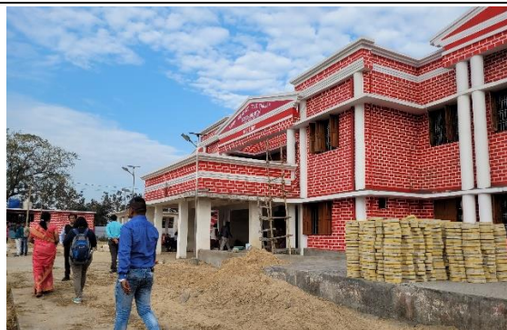
Composite School, Hardi Bazar