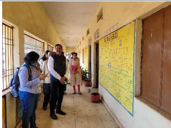
Government Higher Secondary School, Jamul