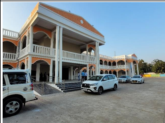
Government Shringi Rishi School, Nagri