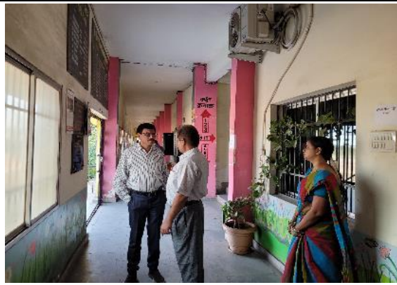
Government Higher Secondary School, Goganv