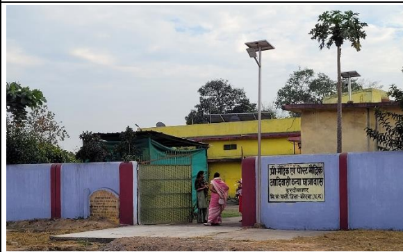
Adivasi Girls Hostel, Hardi Bazar