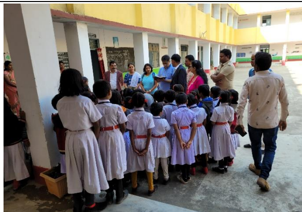
Model Adivasi Residential School, Dhamtari