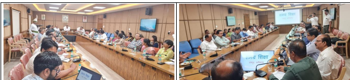
Photographs from the 1 st Multistakeholder Workshop with Government officials