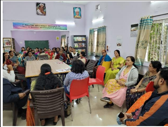
Government English Medium School, Risali