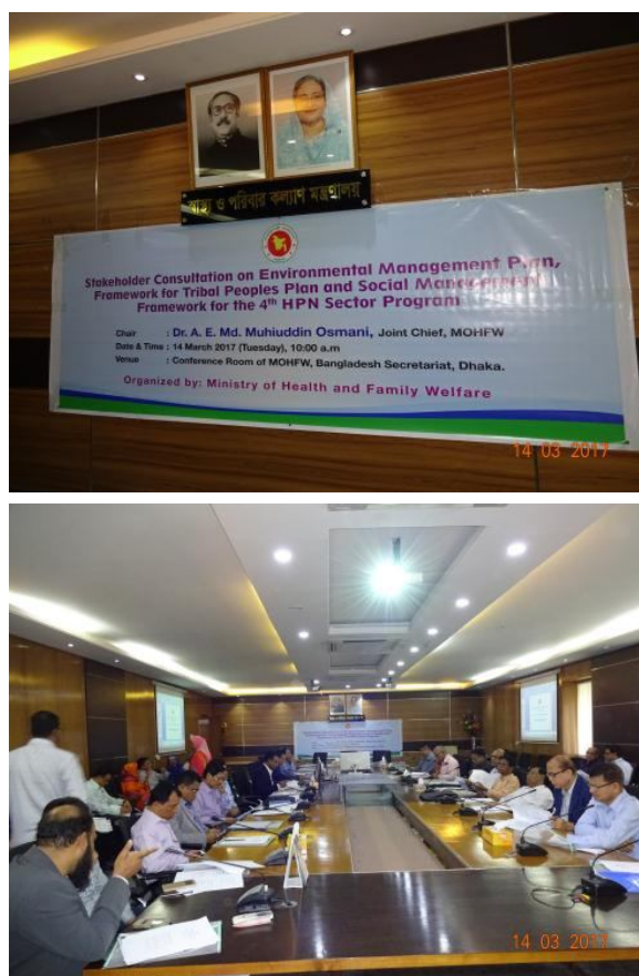
Figure A1: Consultation workshop organized by MOHFW on 14 March, 2017

A stakeholder discussion was organized by the Ministry of Health and Family Welfare (MOHFW) on 14 March, 2017 in the Conference Room of MOHFW, Bangladesh Secretariat on the Environment Management Plan. A wide range of stakeholders (participant list attached in Annex B) including Health Ministry officials (MOHFW, DGHS), Local Government officials (City Corporations), Public works department, health care facilities from Sylhet and Chittagong division attended the meeting (Figure A1). The meeting was chaired by Joint Chief, MOHFW.