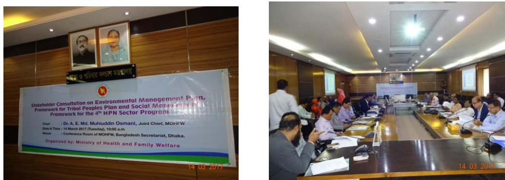
Figure A1: Consultation workshop organized by MOHFW on 14 March, 2017

The consultation was organized by the Ministry of Health and Family Welfare (MOHFW) on 14 March, 2017 in the Conference Room of MOHFW, Secretariat complex, Dhaka. The participants included a broad range of stakeholders from various departments and ministries of the Government of Bangladesh, officials from the MOHFW, health care facilities from Sylhet and Chittagong division attended the meeting, tribal peoples' representatives from the CHTs and plains regions and various CHT institutions such as the CHT Regional Council and Hill District Councils. (List of the participant is given below in the Annex 6) (Figure A1). The meeting was chaired by Joint Chief, MOHFW.